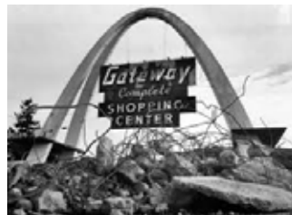
Historic photos of the Gateway Fred Meyer and the Iconic Gateway Arch

The Gateway Action Plan builds upon this important work and provides a framework for Gateway to take advantage of the growing population and employment base in the Portland region. As central and inner city neighborhoods continue to redevelop, demand will increase for housing and employment properties that can offer high-quality transportation access and desirable urban amenities.