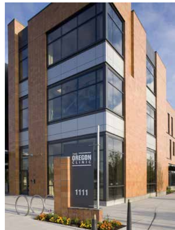
The Oregon Clinic