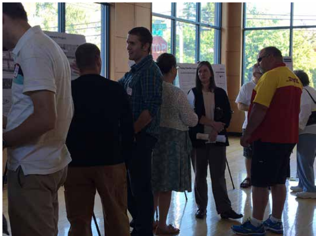
Over 70 community stakeholders attended the Gateway Action Plan Open House