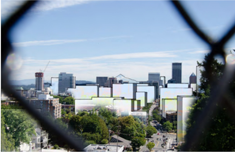
Figure 16: View of Central City and Mt Hood from SW15 – Proposed Bonus Heights

The current views to Mt. Hood from the Vista Bridge are being threatened by the heights proposed in this draft (above). Page 79 states: “The bottom elevation of the view corridor is set based on the height of existing buildings, rather than 1,000 ft below the timberline... With the recommended building heights the view of Mt Hood will remain as it is today...” This statement is untrue as can be seen in the pictures above and below. The view of Mt. Hood will change dramatically so that only the snowcap will be seen--where 1000’ below the timberline can be seen today. It is the contrast between timberline and snowcap that creates this dramatic view.