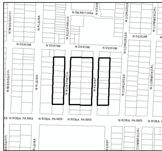
Figure 2: Piedmont properties recommended to retain R5(R2.5) rather than change to R2.5