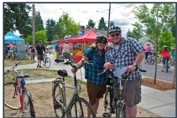
K h unamokwst Park Activity Area

Northeast Portland’s community has been hard at work revitalizing the Cully neighborhood. This year, at Sunday Parkways, participants had the opportunity to enjoy one of the newest Portland Parks: K h unamokwst Park. There Andando en Bicicletas en Cully (ABC) organized its bilingual bike fair and neighbors got a chance to play on the new play structures and grounds in this new park.