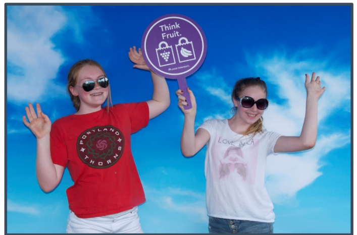
Kaiser Permanente Photo Booth