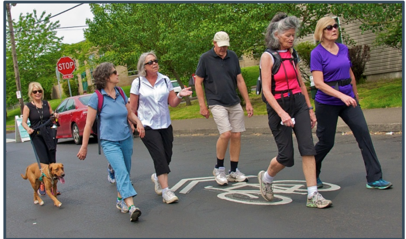
Sunday Parkways Walkers on Neighborhood Greenway

The long-term transportation, health and community benefits are tremendous. When people discover just how much fun it is to walk, bike, roll, skate, and stroll (again) and how easy it is to be physically active during Sunday Parkways, they are choosing to experience “Sunday Parkways Every Day” – walking to the store, riding their bikes to work, playing in the parks – incorporating physical activity into their everyday lives.