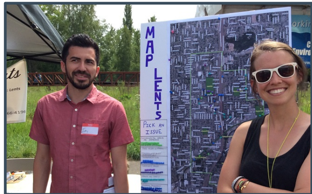
Lents Neighborhood Volunteers

This year’s East Portland event saw the largest number of participants of any May event and any event in East Portland. There were numerous activities that moms and whole families could enjoy including a soccer tournament held all day in Bloomington Park (see next page), Zumba classes provided by the Portland Parks and Recreation East Portland Community Center, and Partyworks brought out an inflatable house for the kids to play and jump. The Bureau of Environmental Services again hosted the Foster Flood Plain Area activities and gave away “fish hats” to tape on to bike helmets.