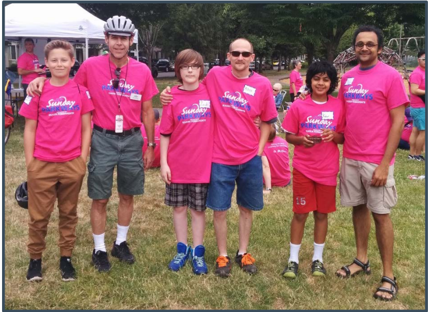
Fathers and Sons Volunteering Together at Sunday Parkways

North Portland again saw the largest attendance on this 9.5 mile route at 31,000 people. It incorporates five activity areas/parks: Peninsula, Arbor Lodge, McCoy, and Kenton Parks plus the Willamette Bluff overlooking the river and Forest Park.