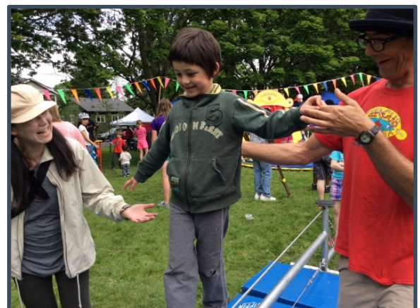
Circus Cascadia Kids Circus

Bollywood dancing Hand cycles Stilt walking Zuma classes Tai Chi classes Unicycle riding