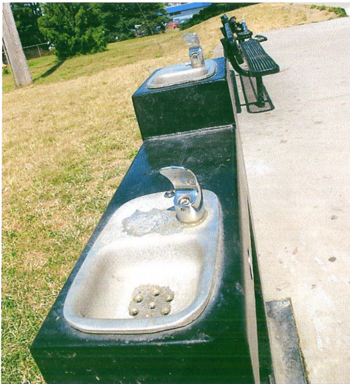
Drinking fountain at the Skate Board park