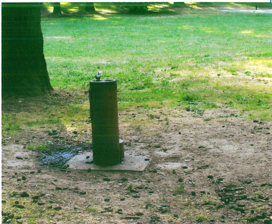
Drinking fountain at the children's playground