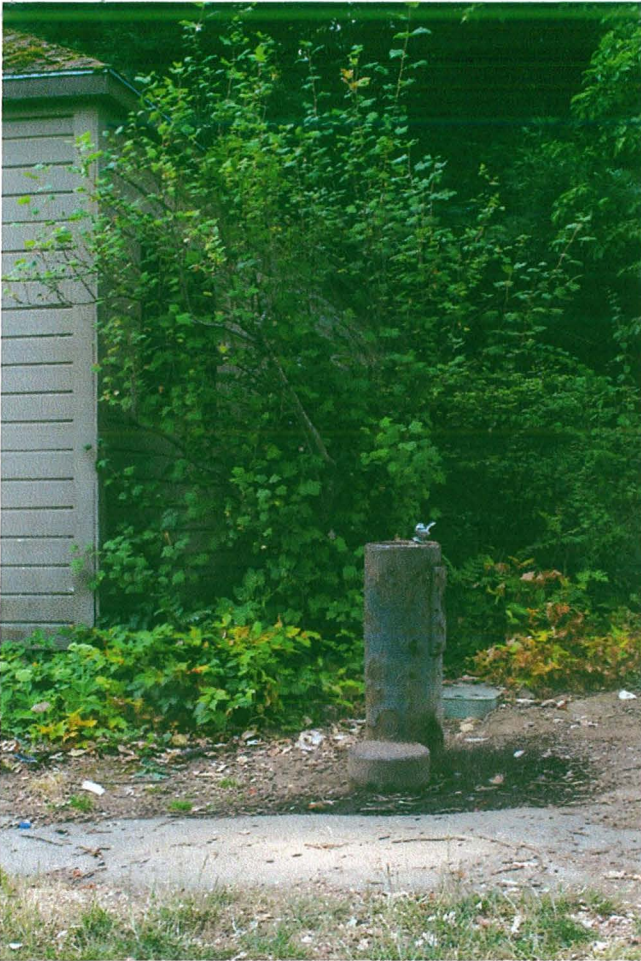
Drinking fountain by Maintenance bldg.