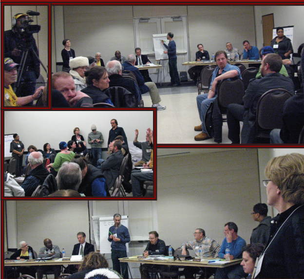
CRC members, IPR staff members, and Portland community members participating in the Community Public Forum on Police Accountability at the East Portland Community Center on January 26, 2012.