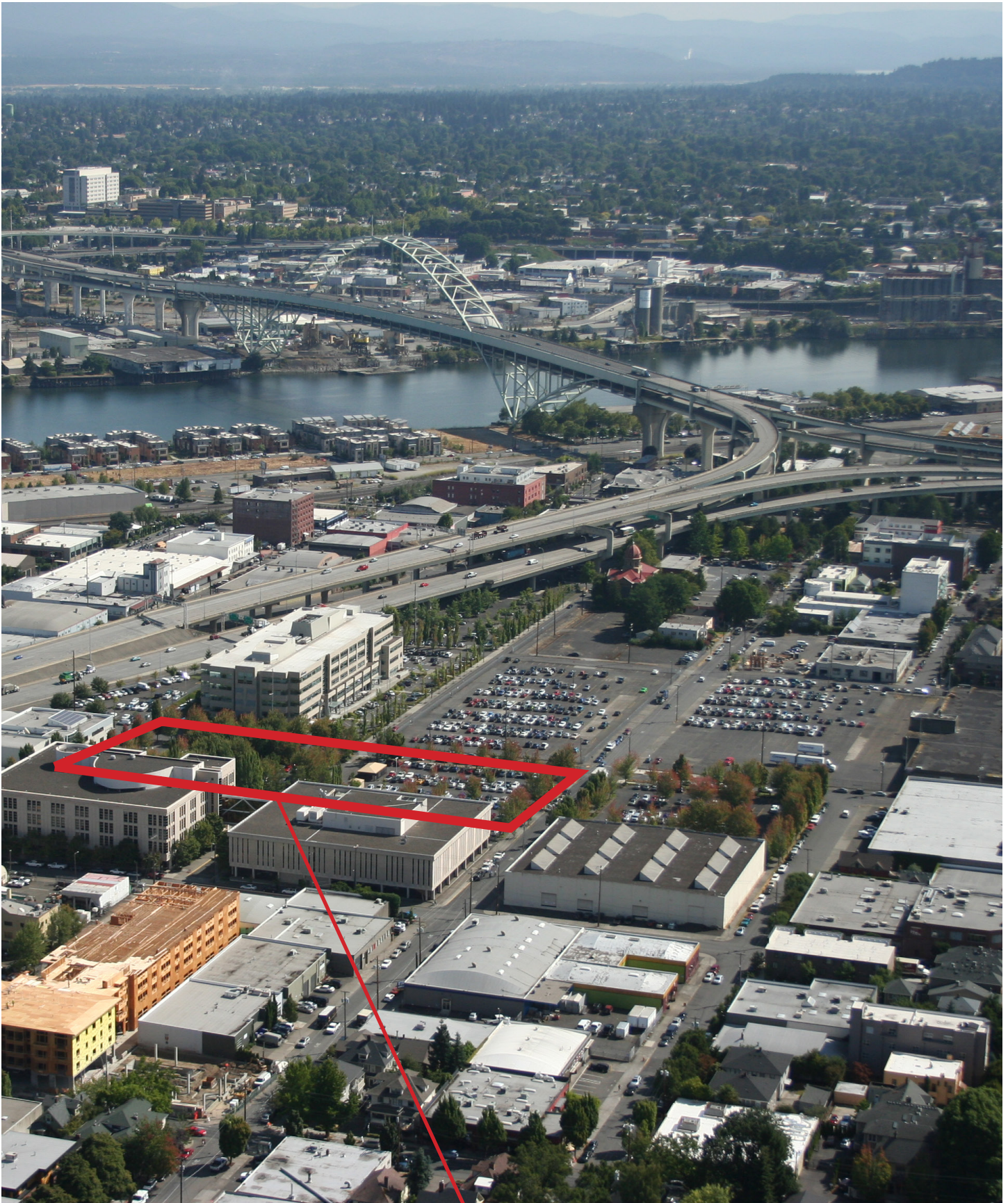
Looking northeast towards the Willamette River and East Portland.