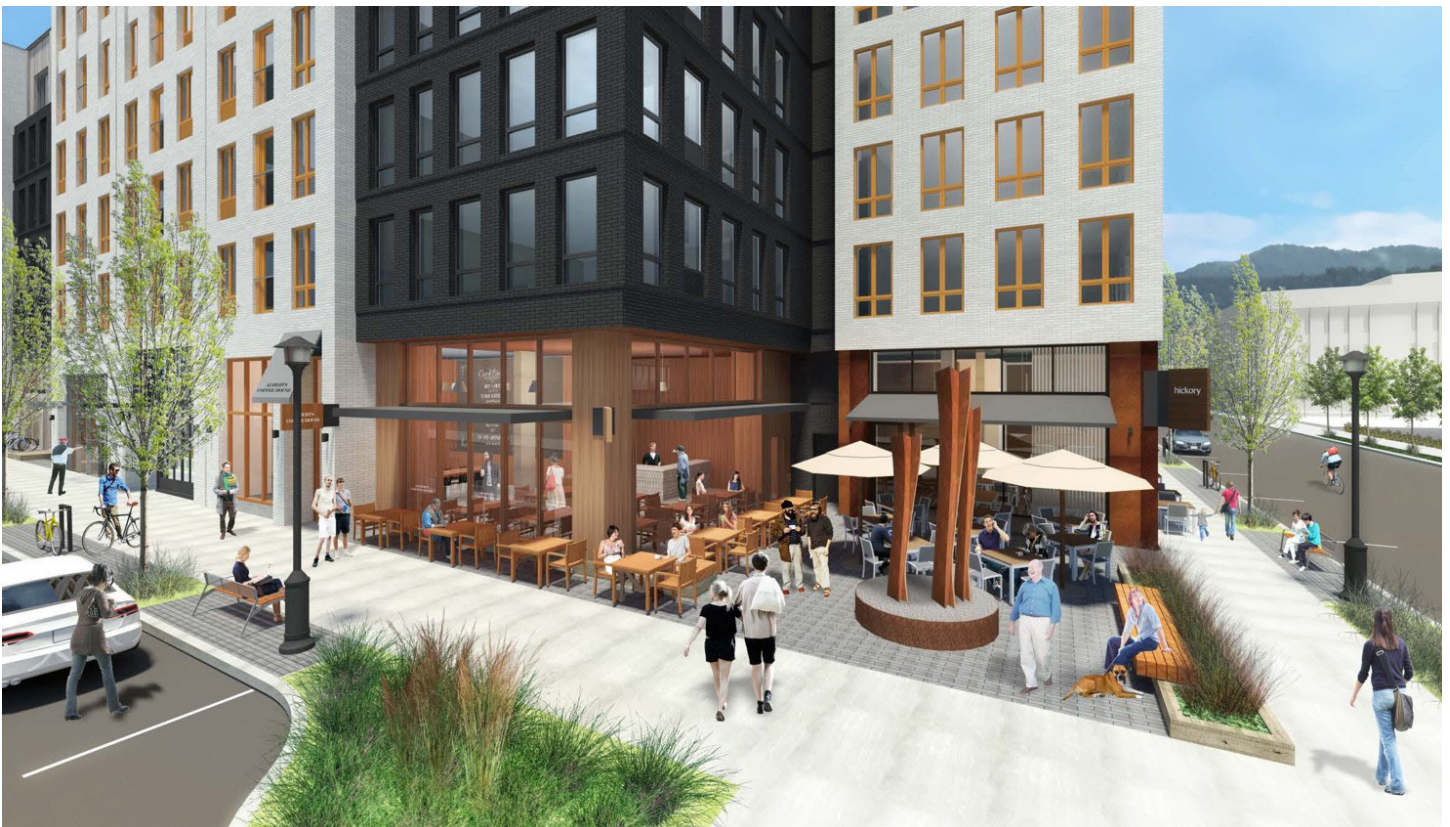
Future condition at Block 296E (LL Hawkins). View is from corner of NW 21st and NW Raleigh.