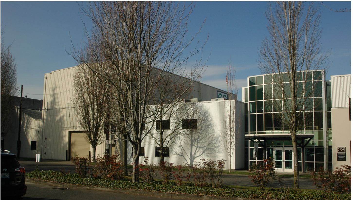
Existing condition at EC building along NW Thurman (property directly north of block 294).