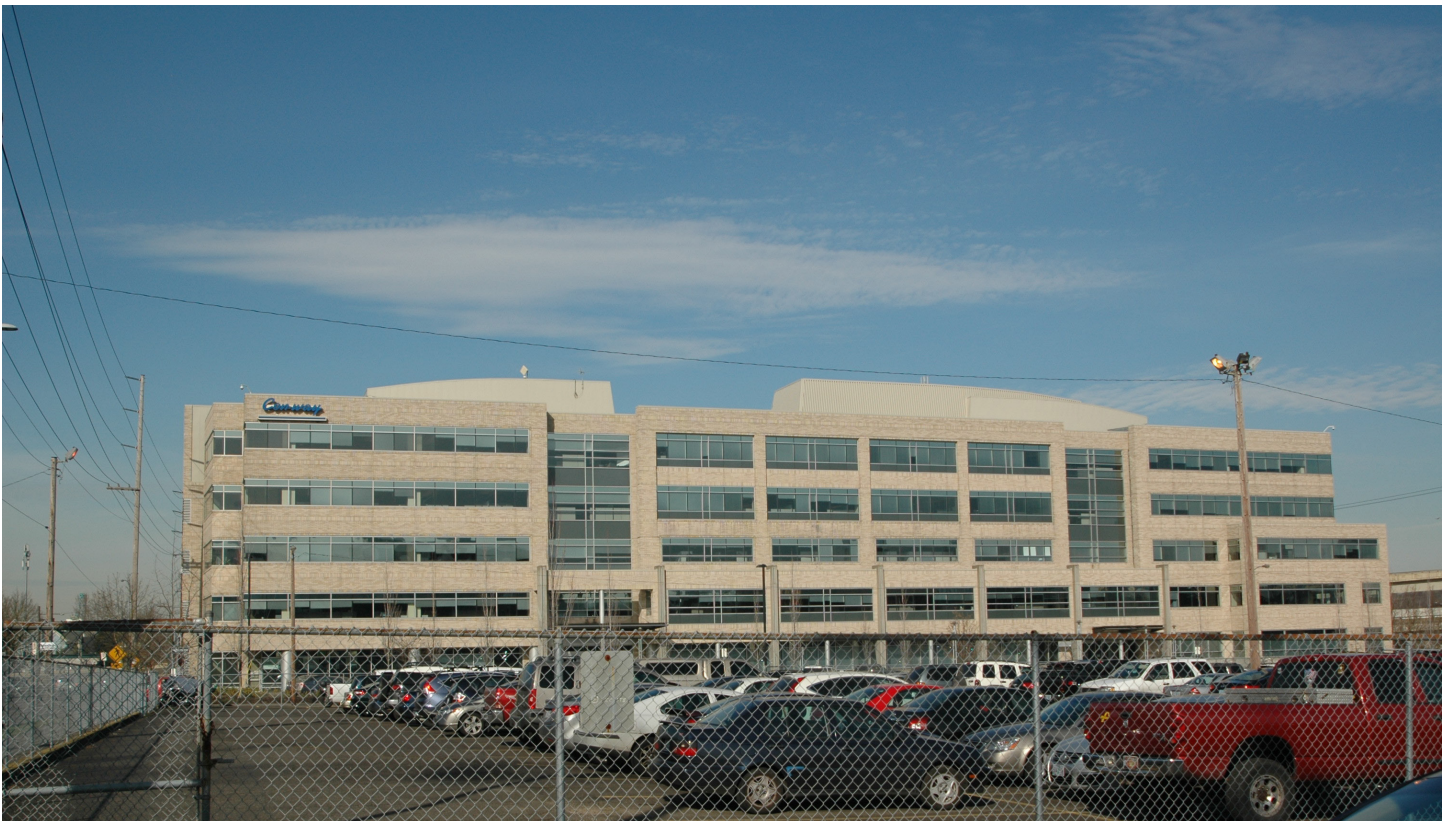
Existing condition at Block 293 (Adtech).