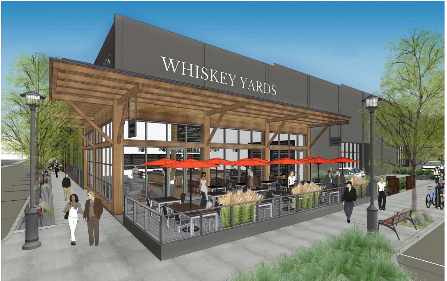
Future condition at Block 296W (New Seasons). View is from NW Raleigh and NW 22nd.