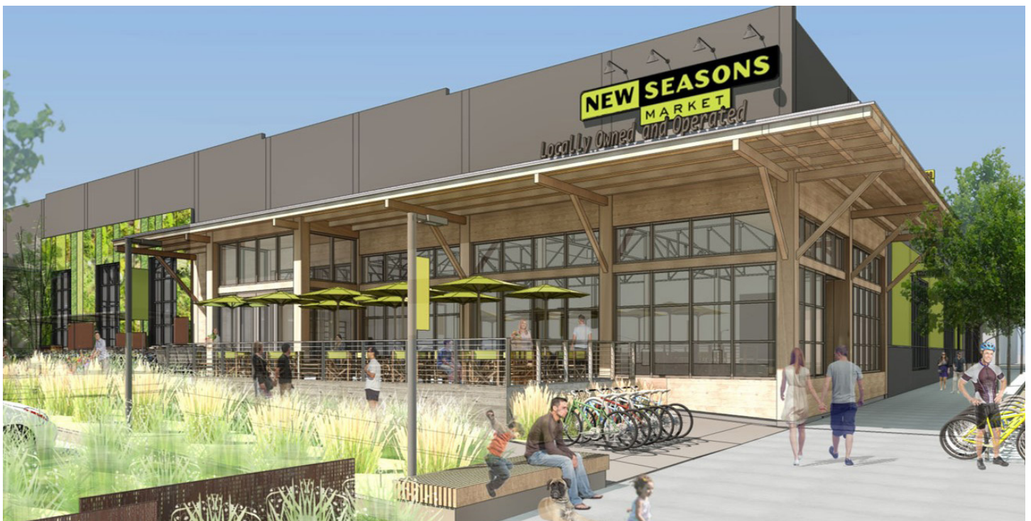
Future condition at Block 296W (New Seasons). View is from NW Raleigh and pedestrian accessway.