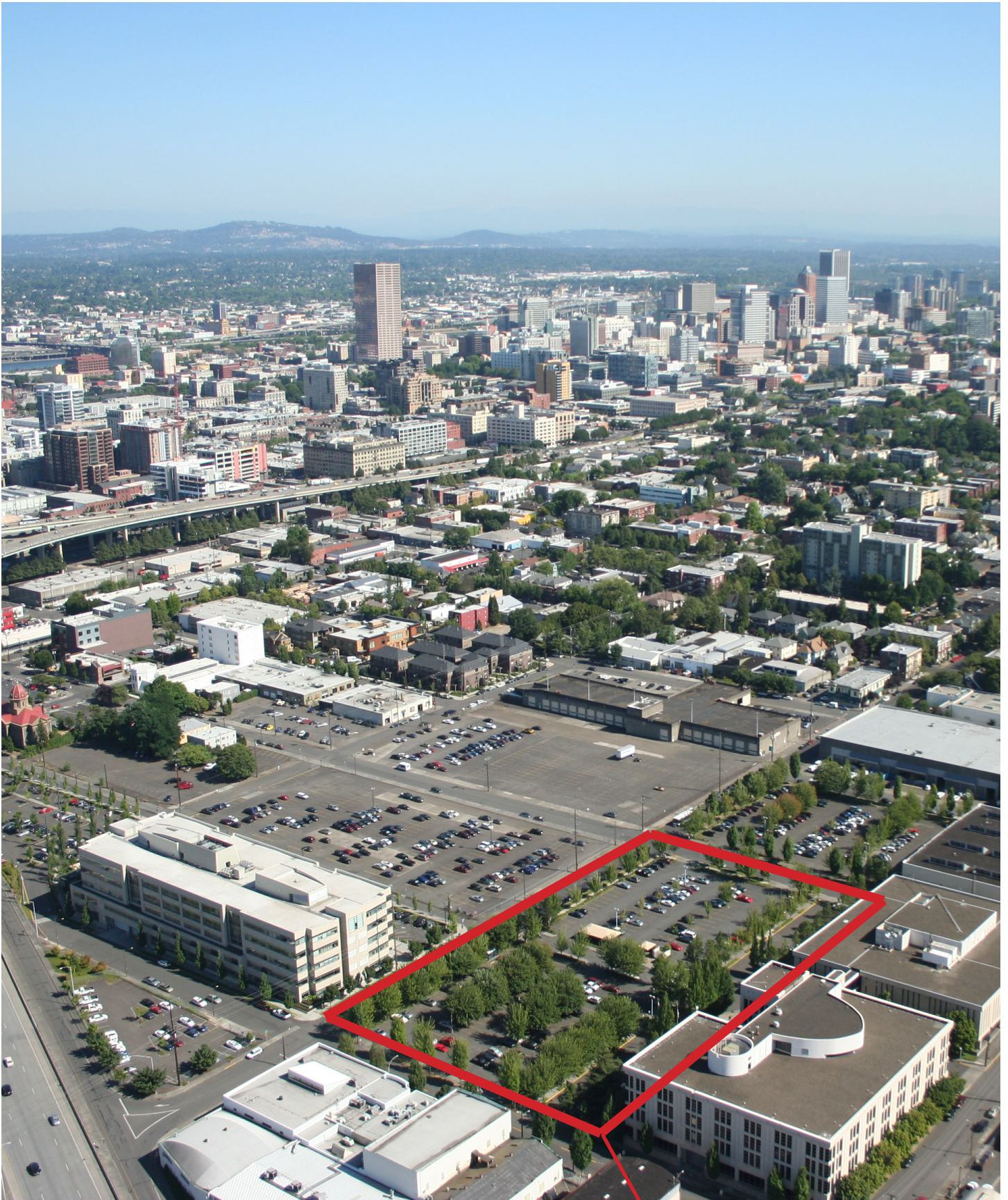
Looking southeast towards downtown