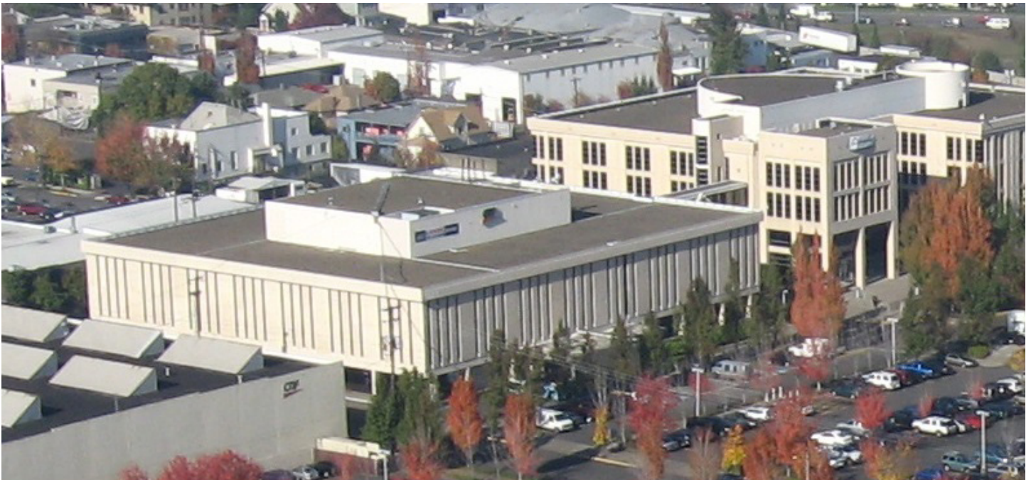
Existing condition at Block 295W (Existing LJC I). View is from NW Raleigh and pedestrian accessway looking NW.