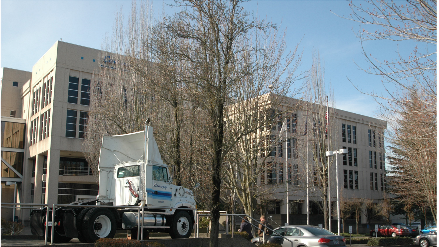
Existing condition at Block 294W (LJC II).