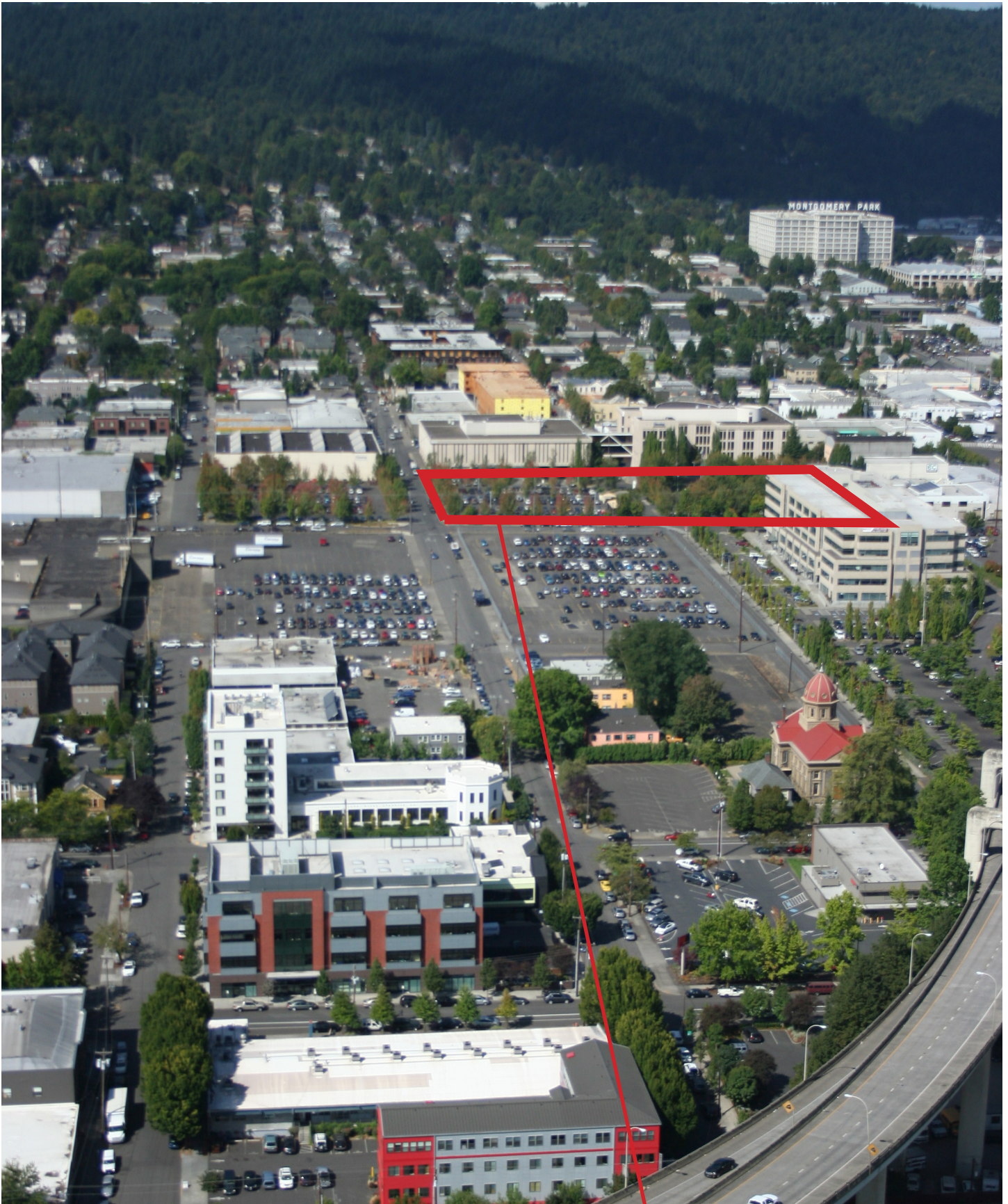
Looking west towards Forest Park.