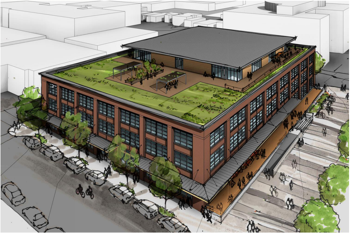
Future condition at Block 295W (Existing LJC I). View is from NW Raleigh and pedestrian accessway looking NW.