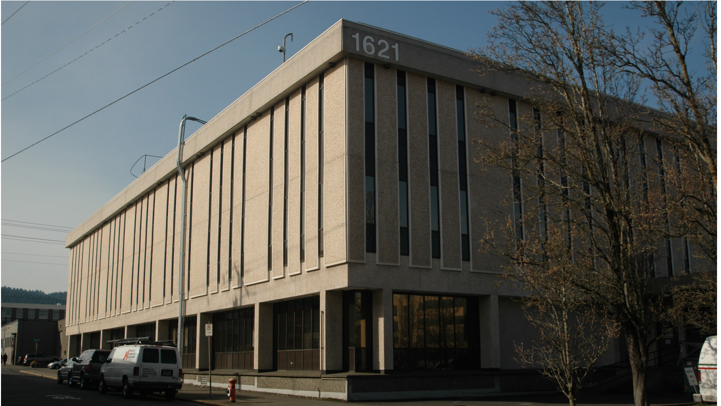
Existing condition at Block 295W (LJC I).