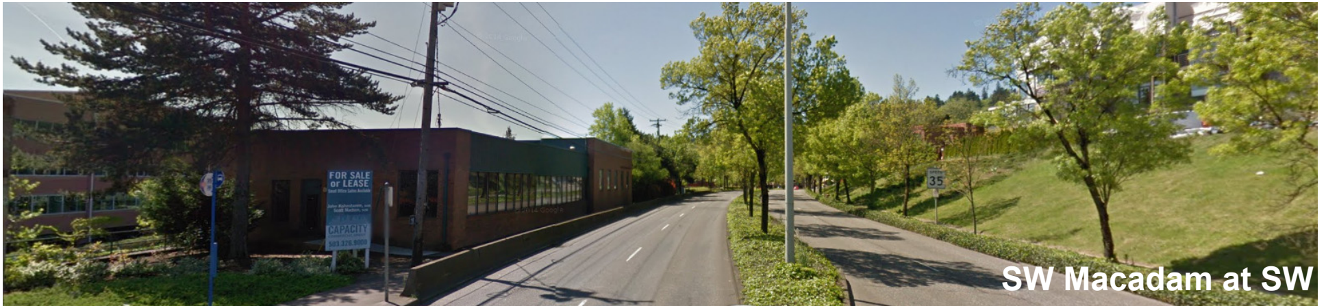
SW Macadam at SW