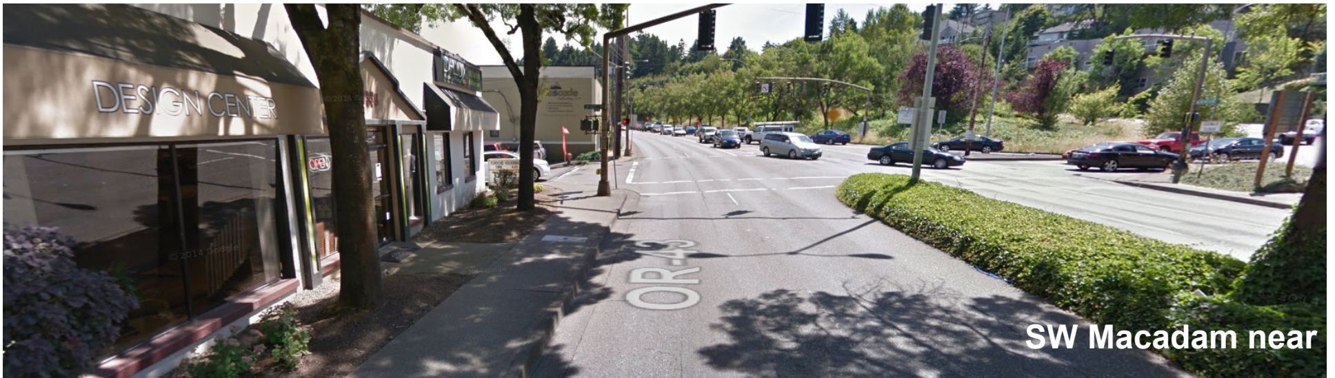
SW Macadam near