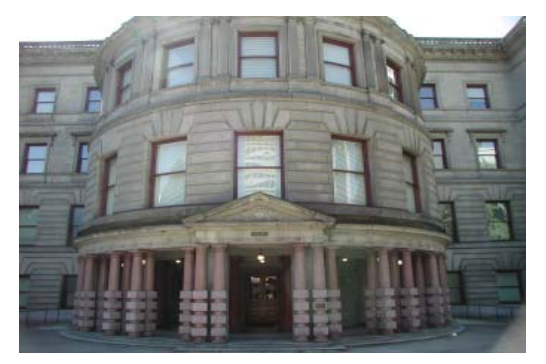
City Hall was originally built in 1895 and renovated in 1998. It houses the Auditor's IPR office, which is located on the third floor. CRC workgroup and public meetings are held in City Hall.

Three cases were mediated last quarter. One of these cases was originally declined by the supervising commander but he later determined that it should be handled through mediation instead.