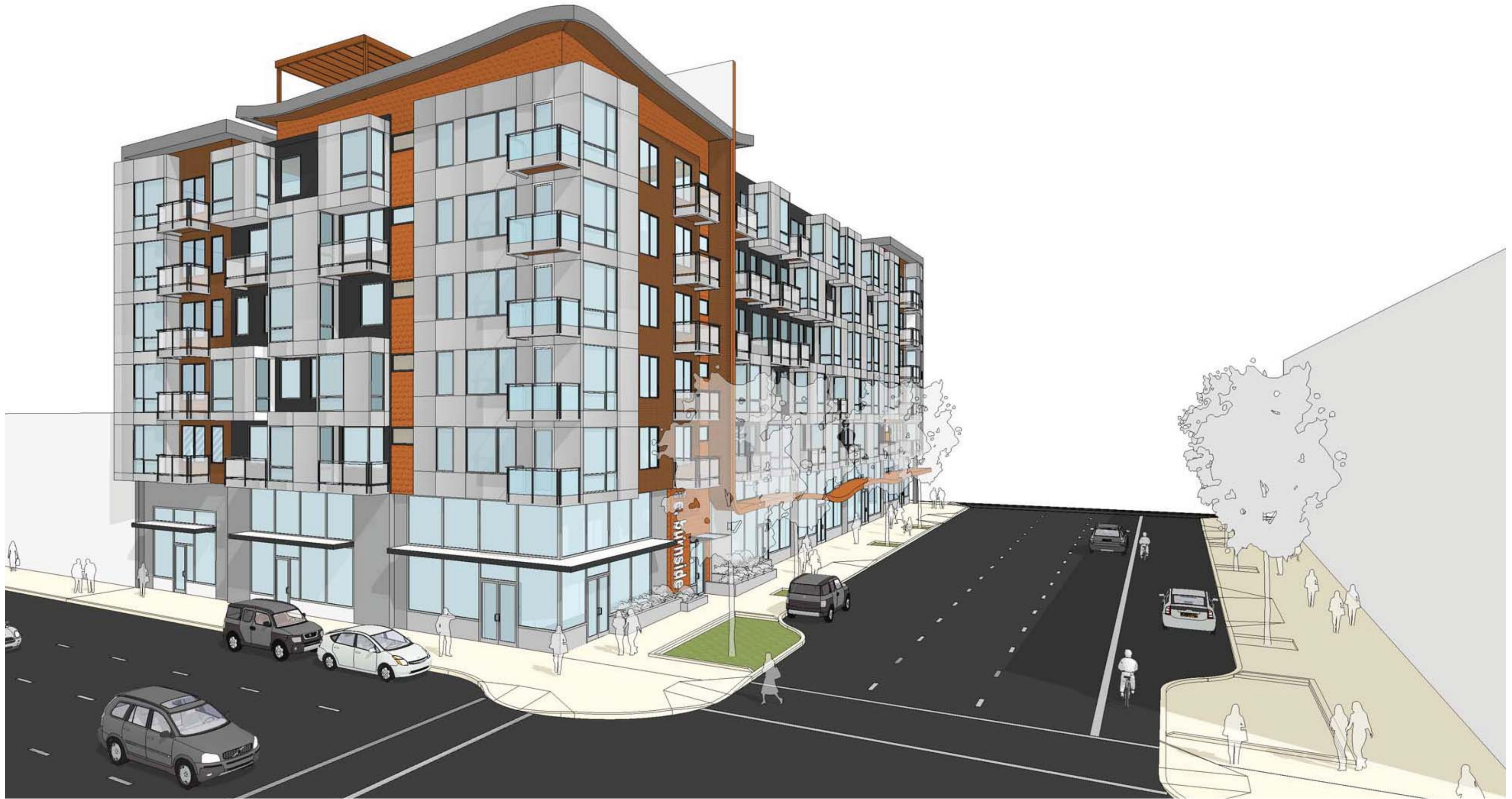
VIEW FROM SOUTH WEST CORNER