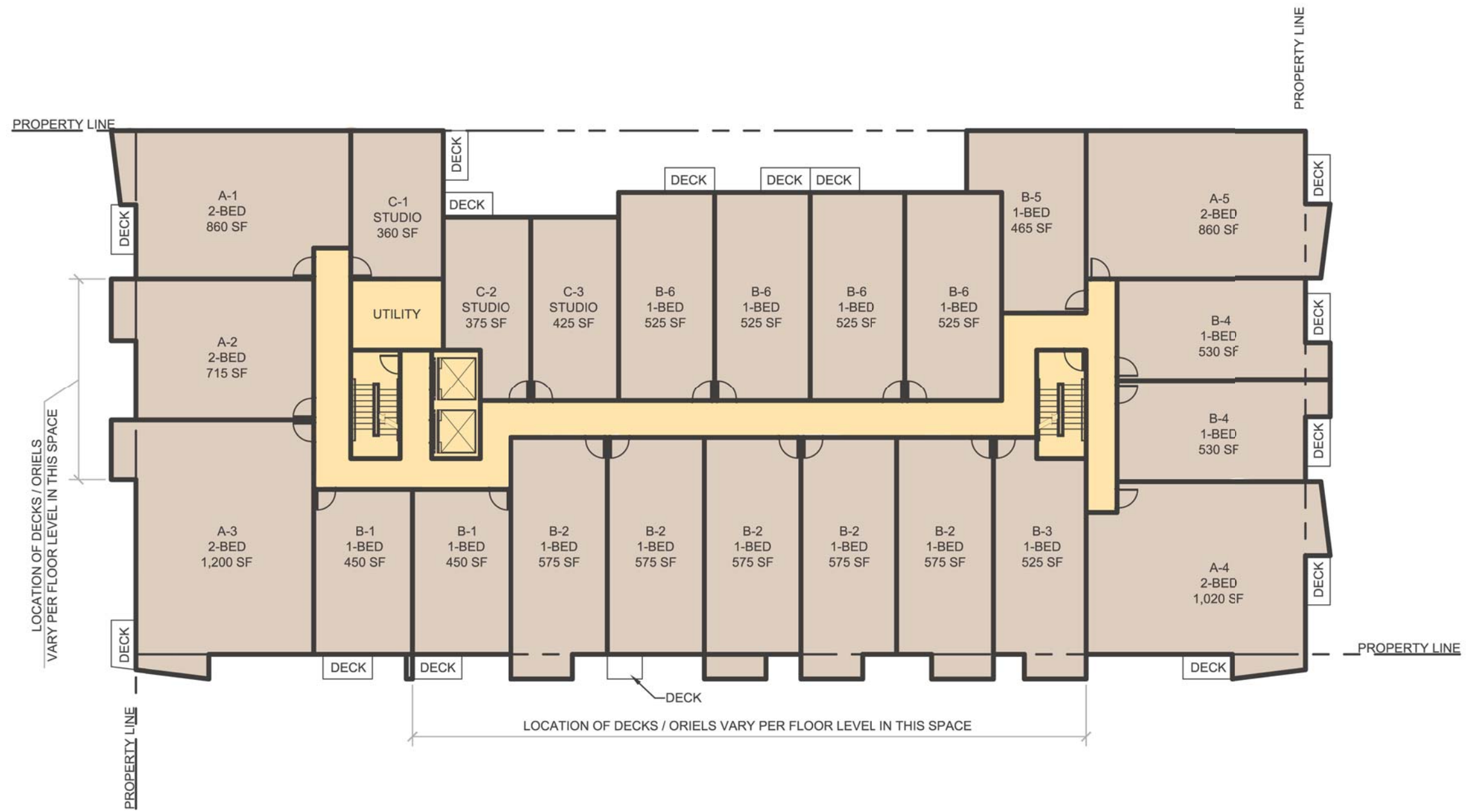
N TYPICAL FLOOR LEVEL (2-6)