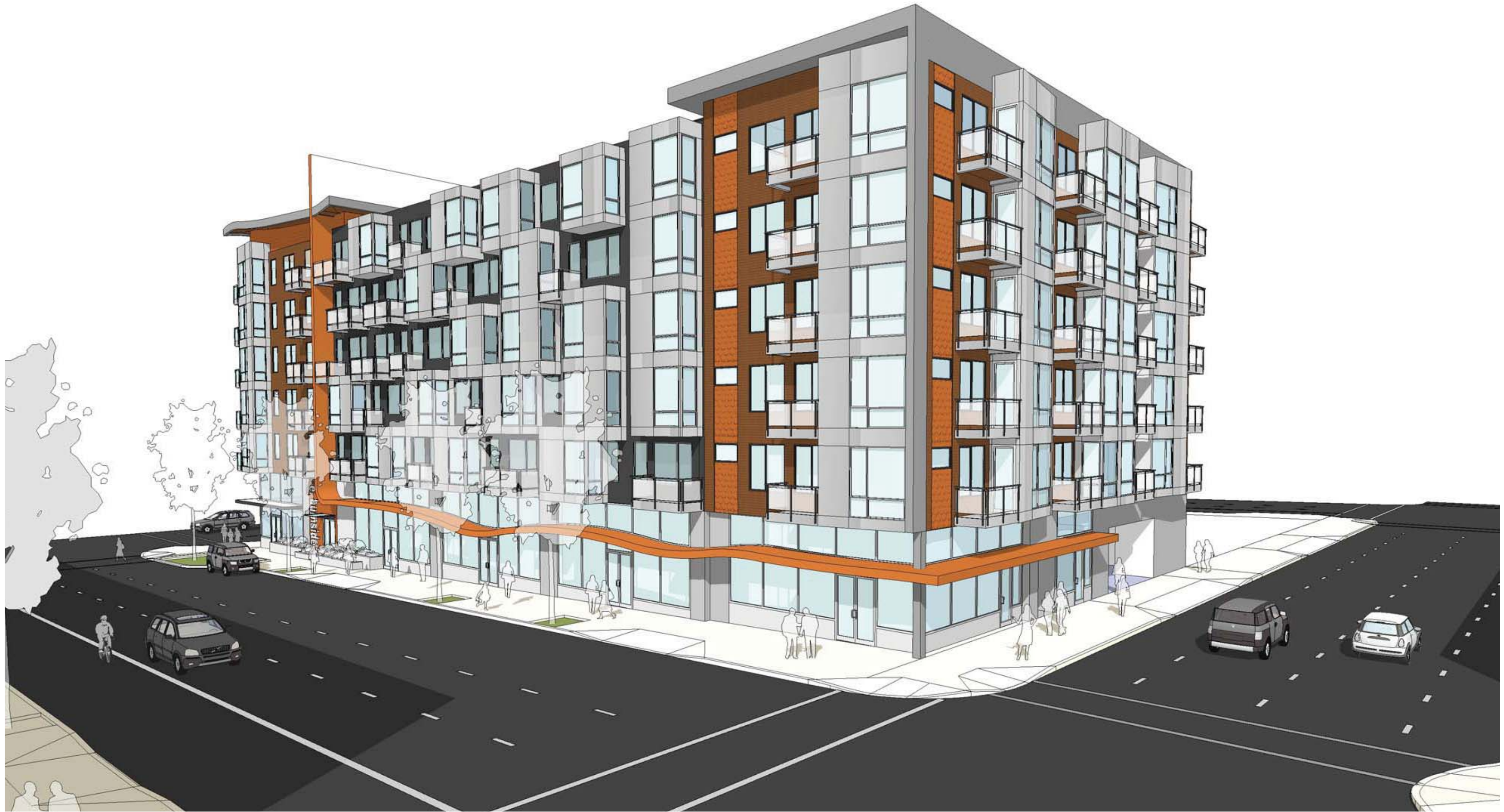
VIEW FROM SOUTH EAST CORNER