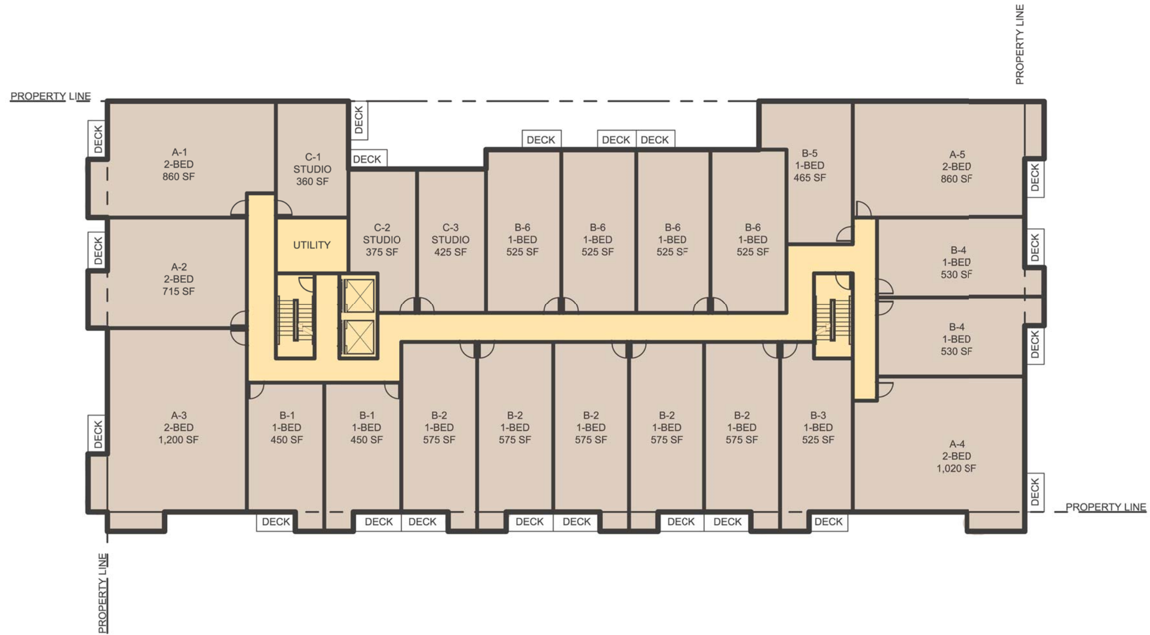
N TYPICAL FLOOR LEVEL (2-6)