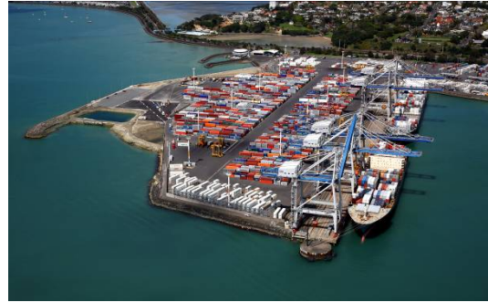
Port of Auckland – land on left side of photo formed by reclaimed dredge material

Some seaports, including the Ports of Auckland in New Zealand, use their dredging material to form new land. The dredged materials are mixed with cement to make mudcrete for the reclamation. The Ports of Auckland have used hundreds of thousands of cubic meters of dredged fill and approximately 40,000 cubic meters of rock from the Wiri Inland Port to form new land and pavement.