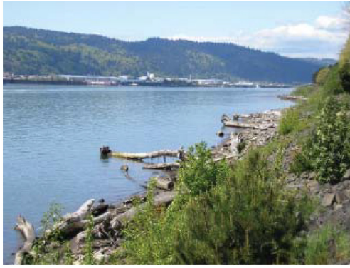
The proposed river environmental overlay zone will conserve natural resources.