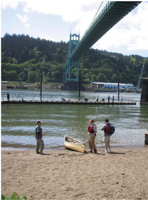
Portlanders take advantage of recreational opportunities in and along the river.