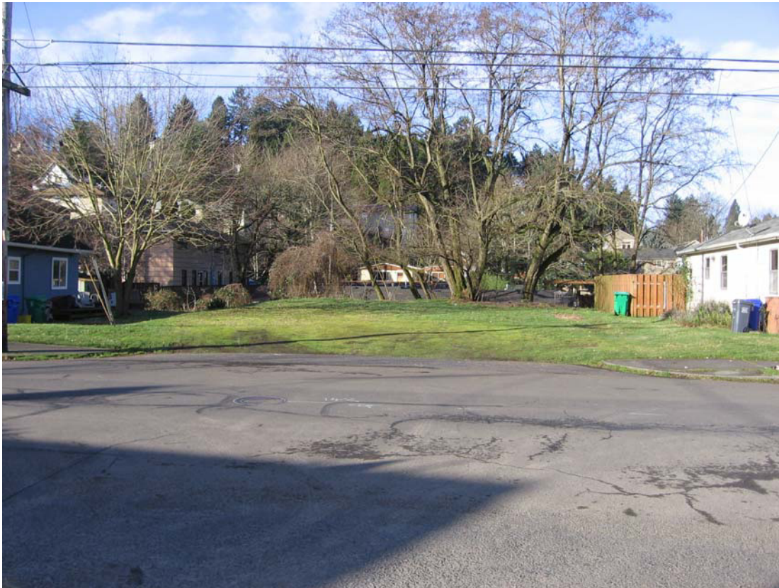
EXHIBIT 2: Photos of area Proposed for Vacation