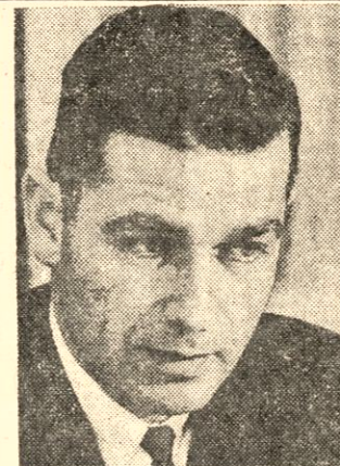
GOV. MARK HATFIELD

and with ultimate responsibility belonging to