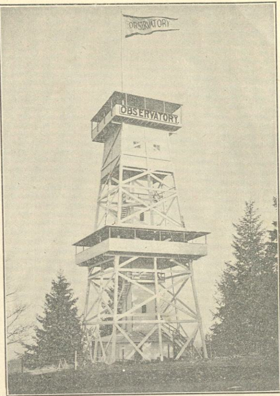
On Portland Heights Street Car Line Admission 10 Cents

Take St. Johns cars on 3d Street. Fare, 5 cents. Time required for round trip, one hour and forty-five minutes.