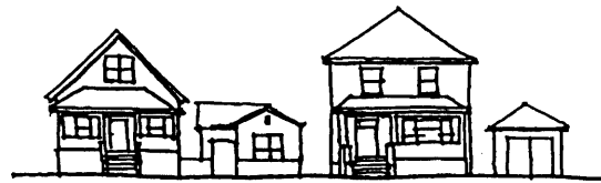
View from Street