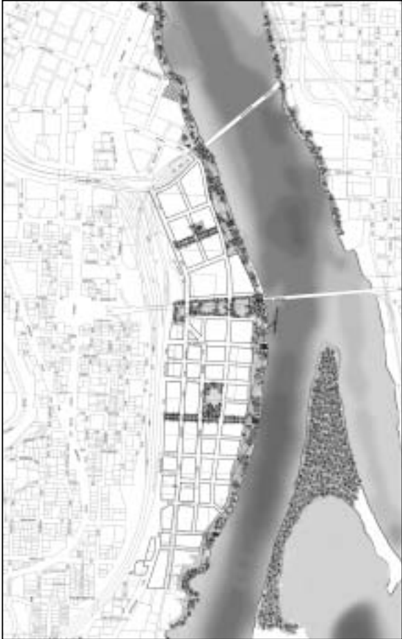
Greenway and Parks Concept Map

River Renaissance is a community-wide effort to revitalize the Willamette River, its banks, and its tributaries throughout Portland. At its core is a vision that will integrate the natural, economic, urban, and recreational roles that make the Willamette River important to the region. A collaborative partnership of citizens, neighbors, businesses, community organizations, property owners, city bureaus, and governments will make the River Renaissance vision a reality. This partnership will translate the vision into a set of strategies, projects, and actions. River Renaissance encompasses new initiatives and efforts already underway, including the City of Portland's Clean River Plan, the Endangered Species Act Program, the update of the Willamette River Greenway Plan, urban renewal plans, and others. The South Waterfront District and its greenway offer a key opportunity to implement the River Renaissance vision.