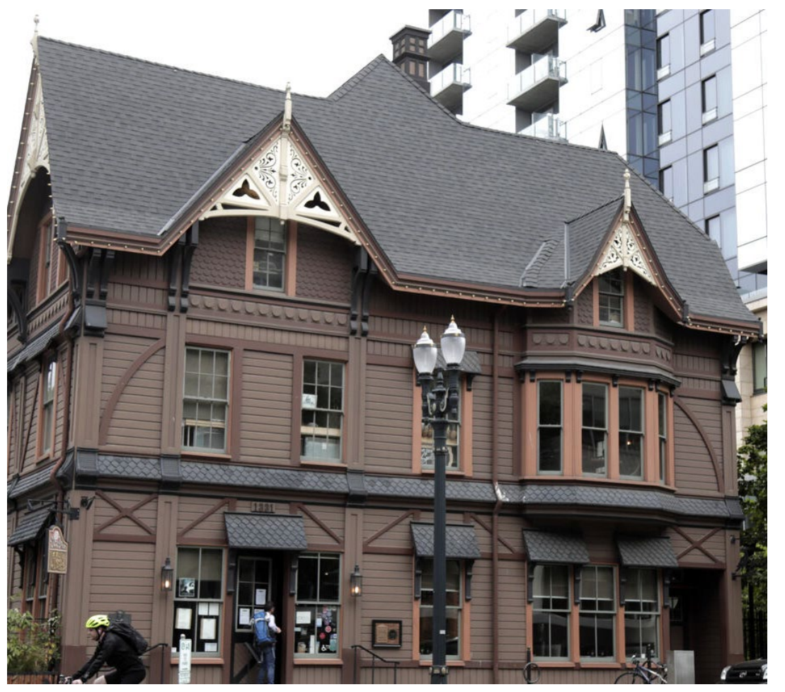
Ladd Carriage House