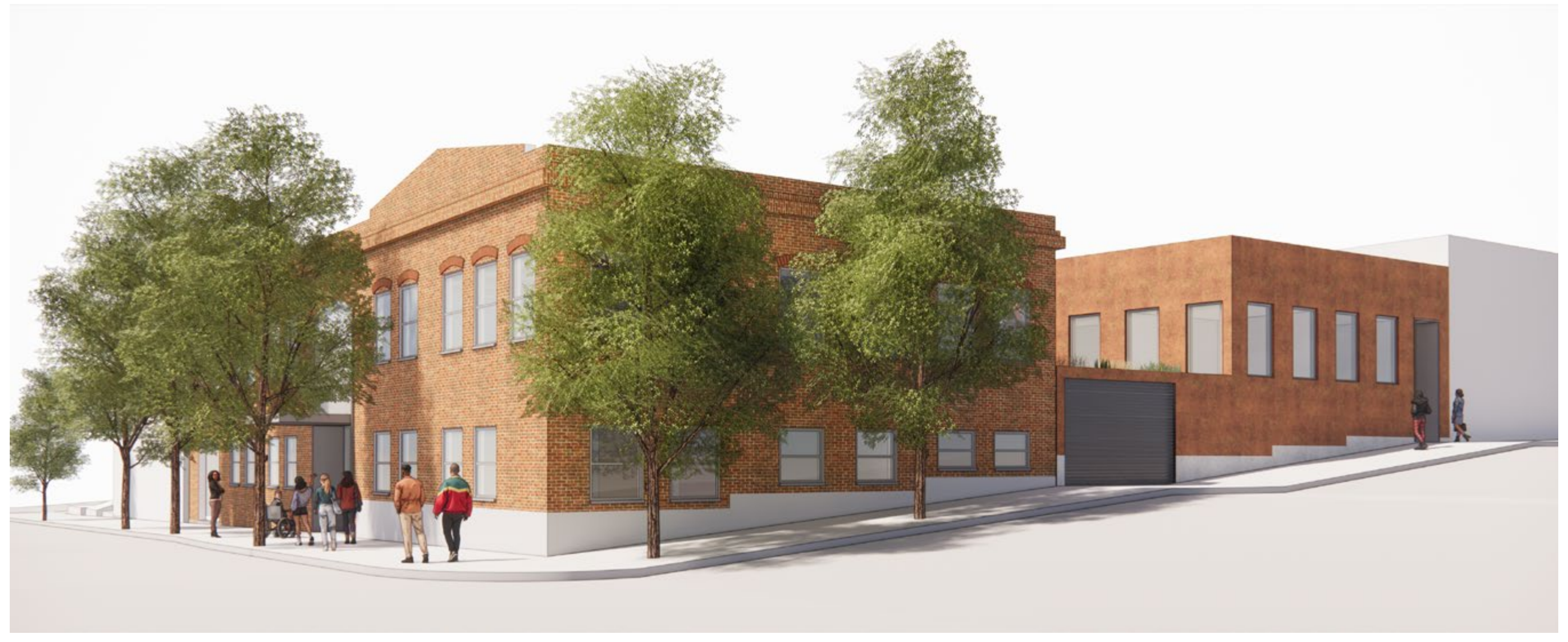
3D VIEW - NE CORNER