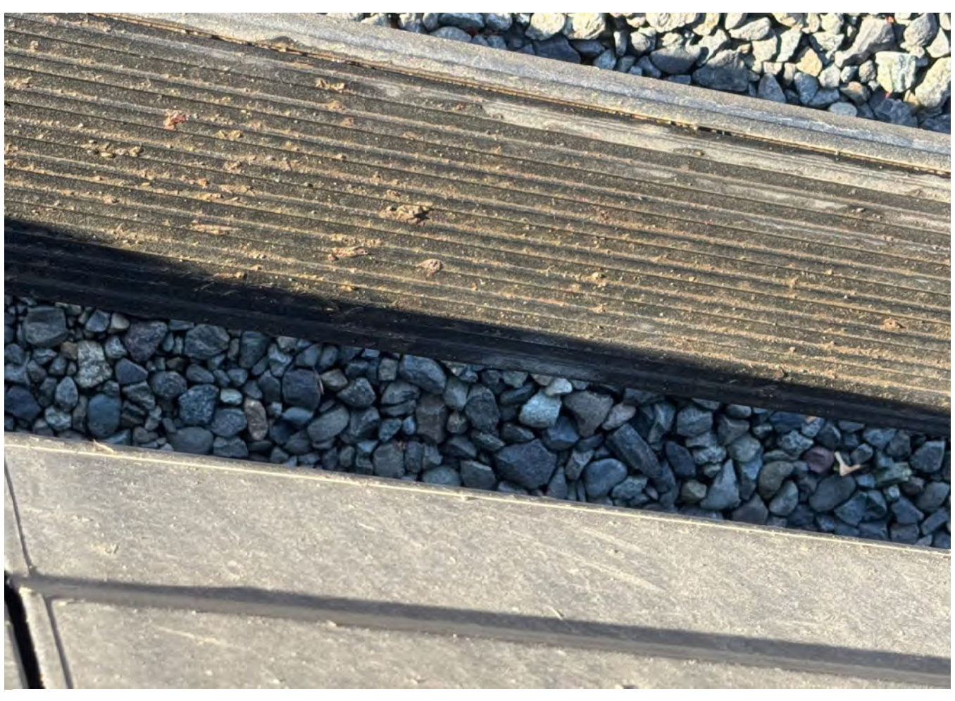
City of Portland Risk Management 1/22/2025