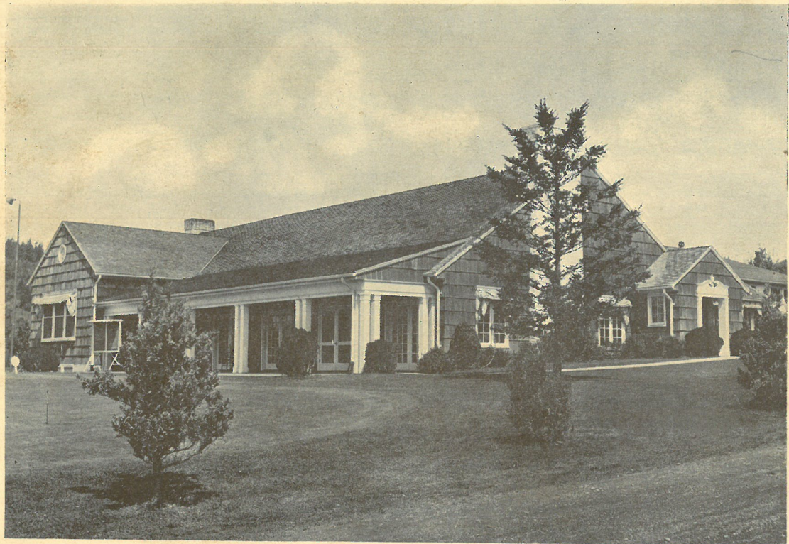
The Gabel School