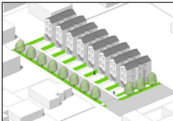
Example of recent development