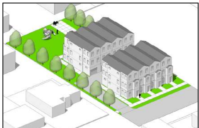
Example of 25% depth-of-site setback