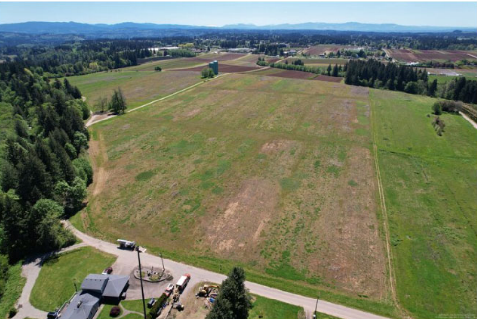
May 10, 2024