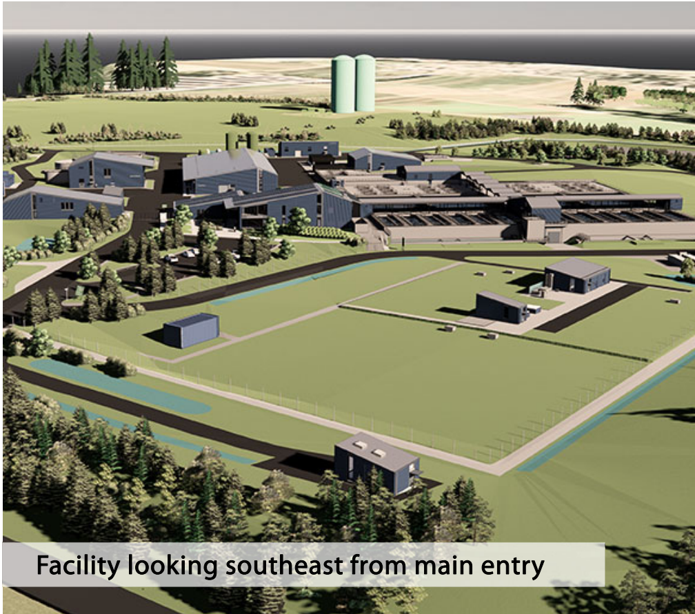
Facility looking southeast from main entry