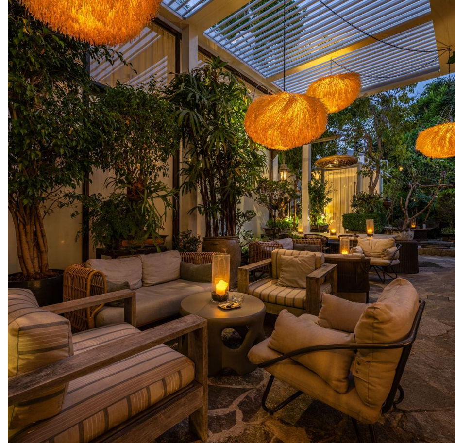
The Woods, a private West Hollywood lounge