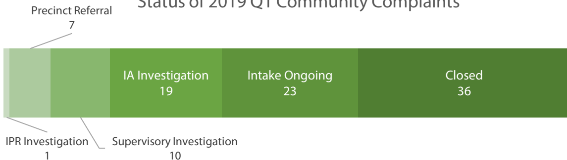
Status of 2019 Q1 Community Complaints

Eighty-two of the community complaints were received by IPR and 14 came through Internal Affairs. IPR opened one case as an independent investigation, Internal Affairs is investigating fifteen cases and intake is ongoing for 23 complaints. Thirty-six complaints were administratively closed, most commonly because no misconduct was identified. Ten complaints were referred to officers' supervisors for investigation and seven were referred to precinct commanders for follow-up. No complaints entered mediation this quarter.