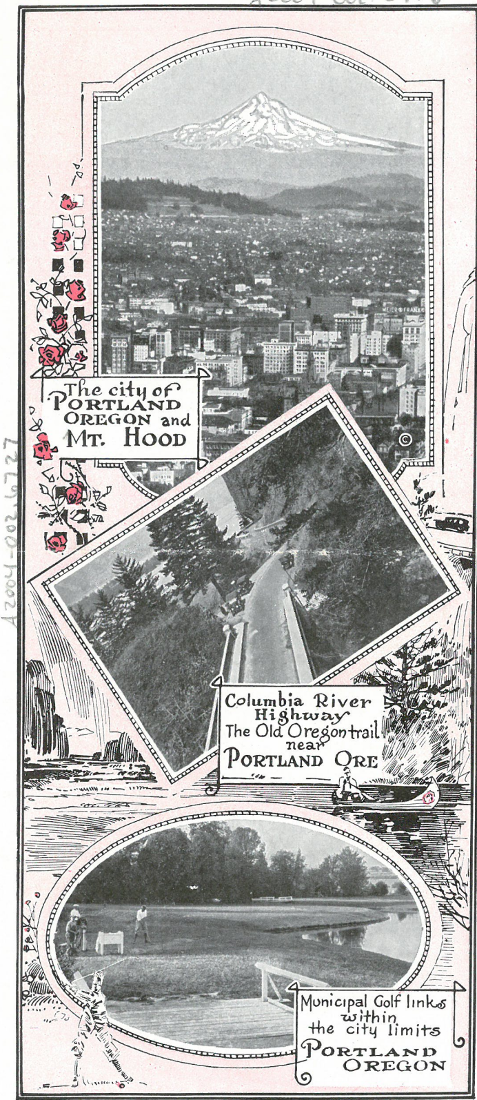
The city of PORTLAND OREGON and MT. HOOD

Of all the large cities on the Pacific Coast, Portland is the only one to offer the mariner an absolute fresh water harbor, which is highly essential for cleaning the boilers and the hulls of the vessels. Municipal and privately owned dockage space and equipment is provided to care for the needs of every nation or commodity. The newest municipal terminal constructed here is conceded to be without a peer on the entire Pacific Coast.