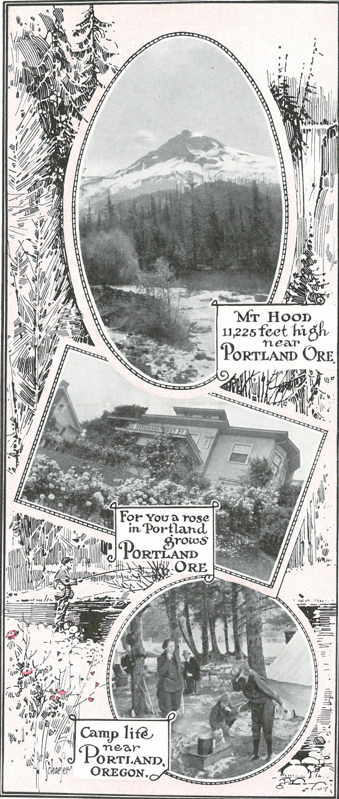
Mt Hood 11,225 feet high near PORTLAND ORE