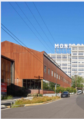
Recent development on NW Wilson St complements the area's industrial heritage through use of building forms and materials.

A century of transition has created a diverse landscape of urban forms and uses in this Center, dividing it into five distinct Subareas 1 . To the East, Subarea 1 provides a transition from the congestion of Hwy 30, while Subarea 2 provides a transition from the residential communities to the south. Adjacent to these is Subarea 3, which is mostly vacant and home to the former ESCO Steel site. Its size creates both a challenge, due to a lack of connectivity between NW 24th Ave and NW 26th Ave, and an opportunity with the arrival of the Portland Streetcar on NW Wilson St and NW Roosevelt St. Subarea 5 1 , along NW Nicolai St, is home to the area's most intense industrial uses and is an important buffer for the district. To the West, the significant historic resources in Subarea 4 1 , the American Can Complex and Montgomery Park, are visible throughout and beyond the district. Each subarea is rooted in rich industrial character that new development should preserve, emulate and celebrate while also creating opportunities for a vibrant, safe and resilient mixed-use center.