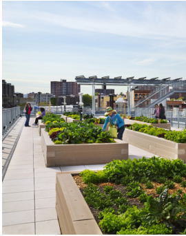
A rooftop community garden provides recreation and respite for residents.

This district is home to a diverse group of residents, businesses and institutions who take immense pride in its industrial heritage and diverse mix of uses. More diverse and accessible public spaces, that acknowledge the contributions of Portland's Black and Indigenous communities, are needed to accommodate this growing community. Future development, particularly in Subarea 1 1 , should honor the District's rich historic industrial character and provide spaces which allow for a true mix of uses, reflecting a history of ingenuity and innovation.