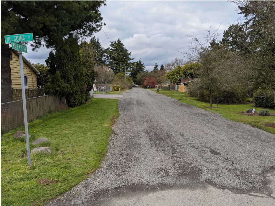
NE 64 th Ave