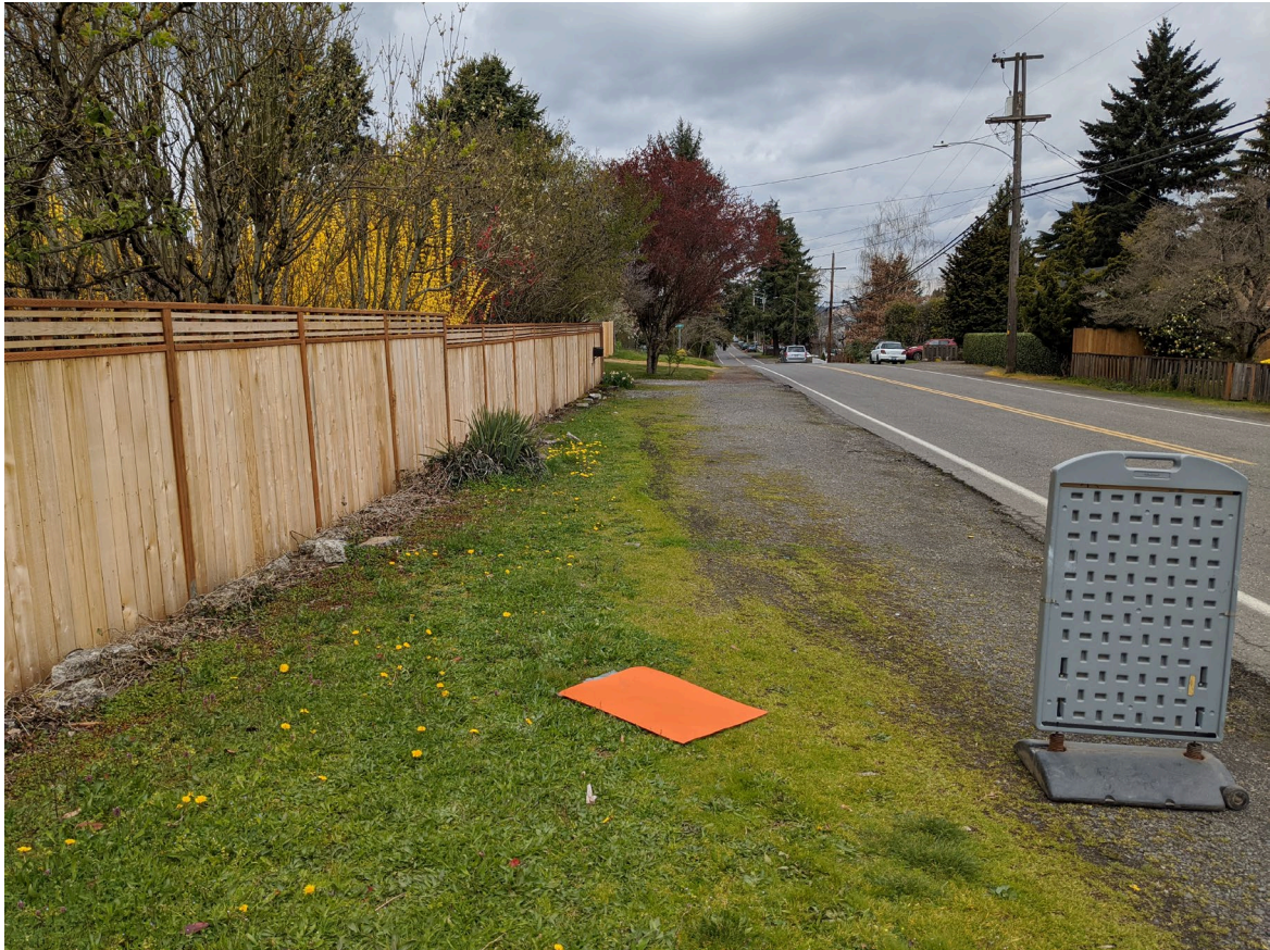
NE 72 nd Ave