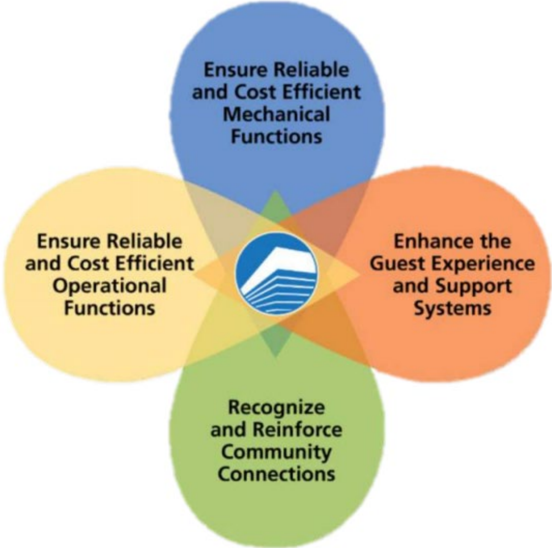
REINVESTMENT STRATEGY'S INTERACTIVE GOALS