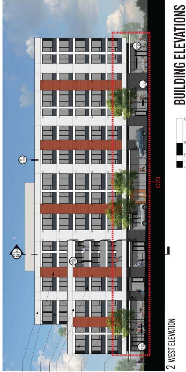
2 WEST ELEVATION