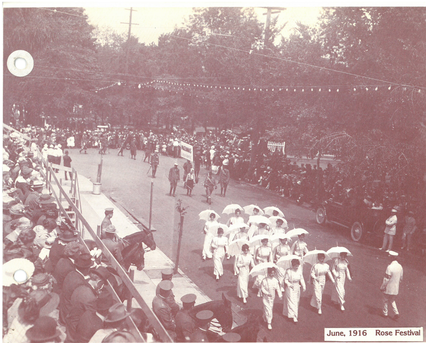
June, 1916 Rose Festival