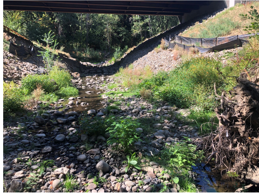
After bridge built- during low flow