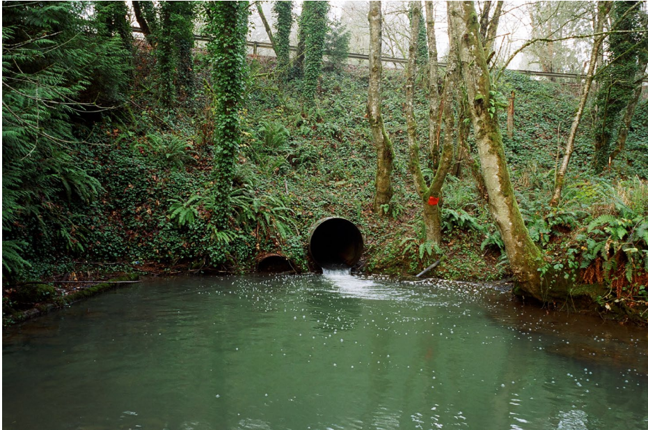
Before Bridge was built