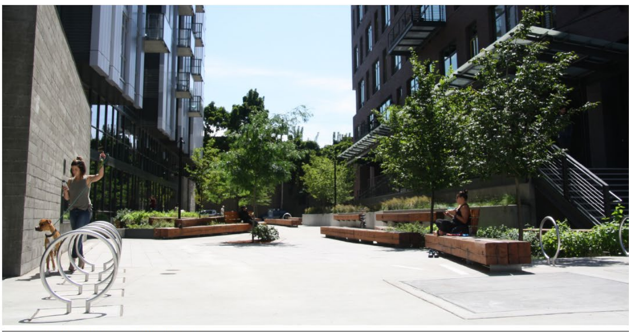
4 PORTLAND CITYWIDE DESIGN GUIDELINES