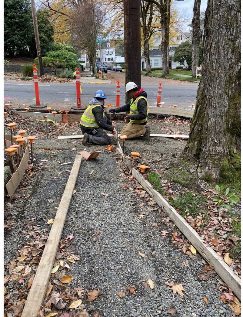
ADA Ramp installation