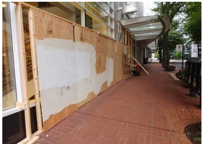
June 2020 to December 2020 Downtown Portland

Neighbors continued this help off and on as needed.