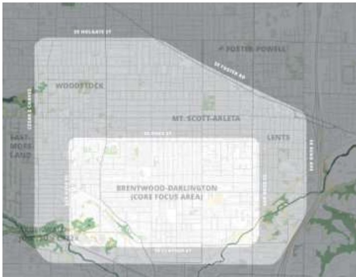
Fig 1. Lower Southeast Rising Area Plan Focus Area

The project focus area lacks commercial opportunities for people to walk or bike to and has limited connections for people to reach nearby centers or corridors, like along Woodstock, Foster or the Lents Town Center, without depending on driving. The project focus area also has a higher than citywide average of low-income households, and historically underrepresented communities and therefore