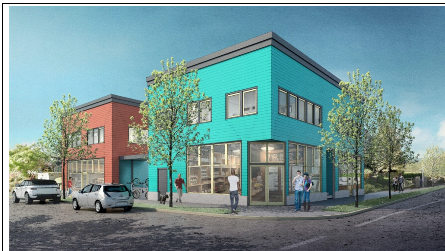
“Jolene’s First Cousin” on SE Gladstone. The green part of the building contains dwelling units rented as apartments. The red part of the building contains ten group living accommodations that share a common kitchen on the ground floor.

Buildings where several bedrooms share a common kitchen, common bathroom, or both can be more affordable than standard apartments, because kitchens and bathrooms are expensive to build. The current code is confusing with regard to Single Room Occupancies, which can be classified as Group Living, Household Living, or Retail Sales and Service uses depending on technical details. The amended code clarifies that there are only two types of residential uses, Household Living and Group Living. References to Single Room Occupancy have been eliminated, but these living arrangements can still occur identified as either a Group Living Use or a Household Living Use under the amended code. These clarifications are made by changing definitions (33.910) and use category descriptions (33.920).