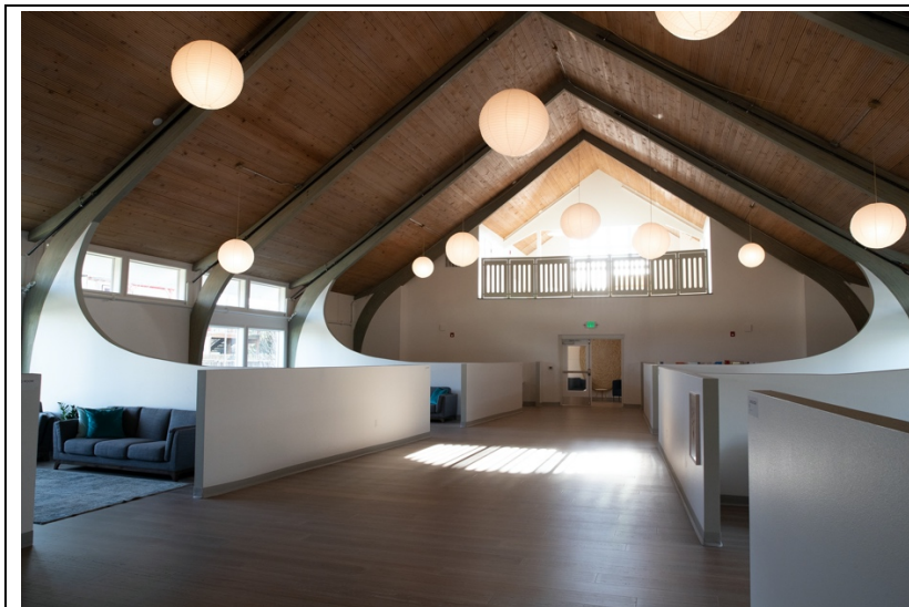
Interior of the Portland Homeless Family Shelter “Family Village.” A Short Term Shelter facility supported by the Joint Office of Homeless Services.

While the code amendments were under development, the Portland Housing Bureau built more apartments with supportive services for extremely low-income individuals and households. The Joint Office of Homeless Services increased its efforts to meet rising demand for emergency and short-term shelter, day storage, and hygiene facilities, while the City provided socially distanced, outdoor tent camping facilities as a COVID-19 response. Metro also made the Oregon Convention Center available as an emergency shelter.