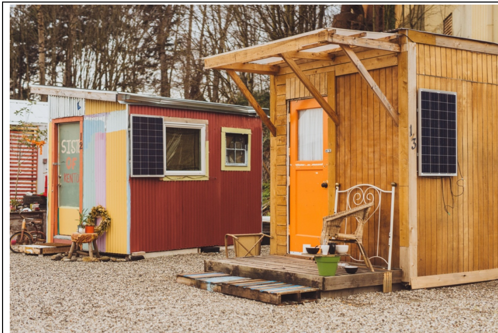
The Kenton Women’s Village An Example of the Outdoor Shelter format.

A narrow exception has also been added to the blanket prohibition on shelters in industrial zones. This is accomplished through modified approval criterion in 33.815. This exception would only apply to outdoor shelters on small sites on publicly owned land.