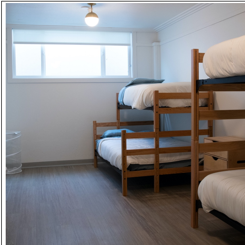
An individual bedroom within the Portland Homeless Family Shelter. A facility in the Short Term Shelter format.

Using the term “housing” for a shelter facility not intended for long-term residential occupancy can create confusion and may imply landlord-tenant relationships exist. In general, housing is intended for permanent occupancy, and shelter is intended to serve transitional or emergency needs. The updated code makes numerous substitutions of terminology in several zoning code chapters to make the distinction between shelter and housing clearer. For example, the amended code changes the name of the Community Service use “Short Term Housing” to “Short Term Shelter” because the relationships in these facilities are provider to client or host to guest rather than landlord to tenant.