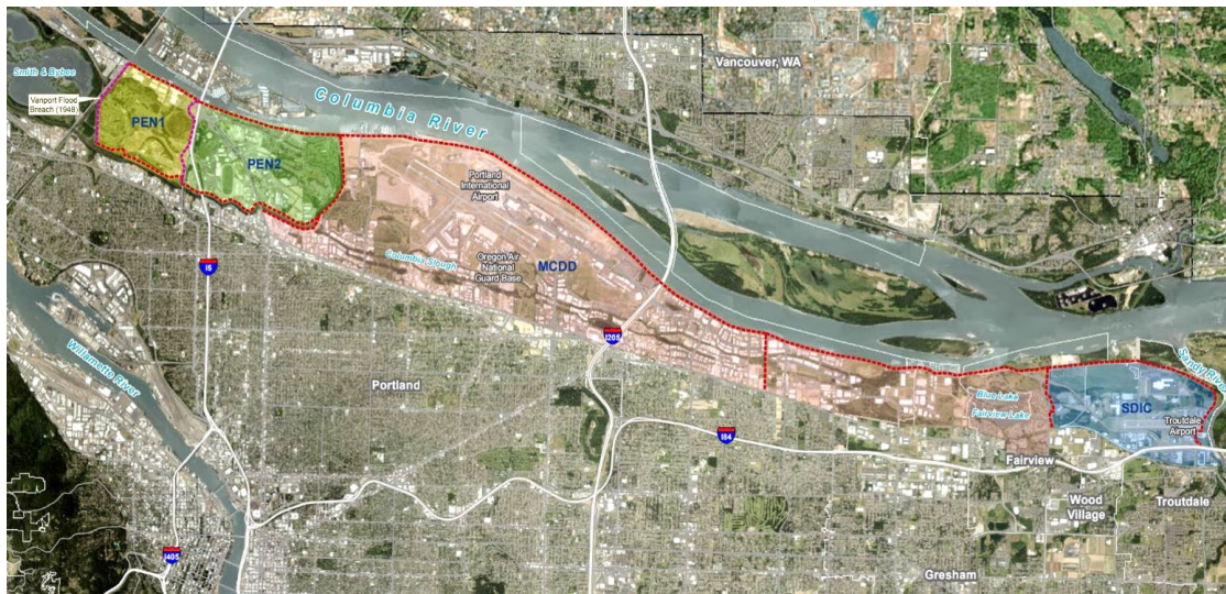
Figure 1.0 – Drainage District Boundary Map

The Drainage Districts are currently undergoing a major modernization of our governance and infrastructure systems to meet flood protection needs in the region and ensure we are providing adequate levels based on the land use changes in our area over the last 100 years. By working together to clarify existing exemptions, we can align interests that protects the health, safety and general welfare of our local community.