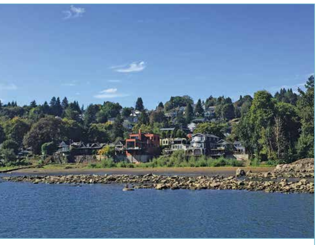
Single-family homes next to the river's edge are common in the South Reach.