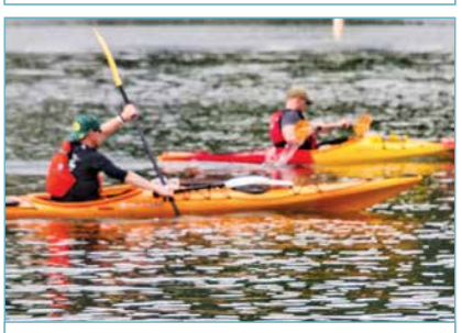
Water-based recreation opportunities abound on the South Reach.