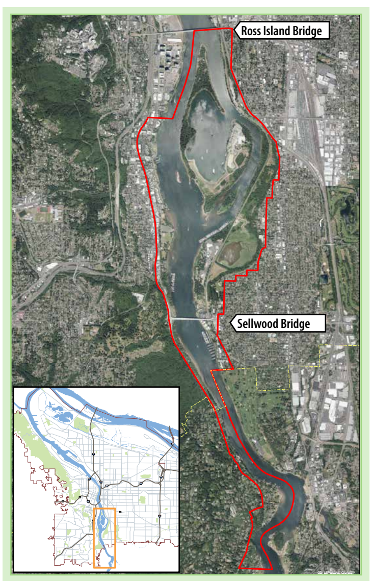
The South Reach project boundary, in red above, extends from the Ross Island Bridge down to and including the unincorporated Multnomah County neighborhood of Dunthorpe. The boundary is aligned with SW Macadam Blvd to the west and generally follows the bluff to the east.