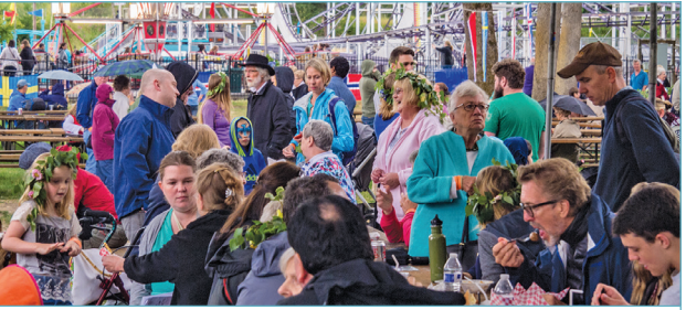
Residents of nearby neighborhoods have easy access to amenities like Oaks Amusement Park.