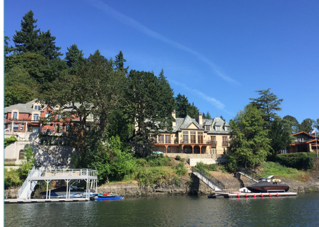
Single-family homes next to the river's edge are common in the South Reach.