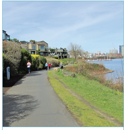
The Willamette Greenway trail was made for runners, walkers, rollers and strollers of all ages and abilities.