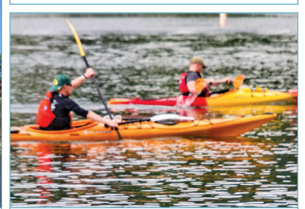
Water-based recreation opportunities abound in the South Reach.