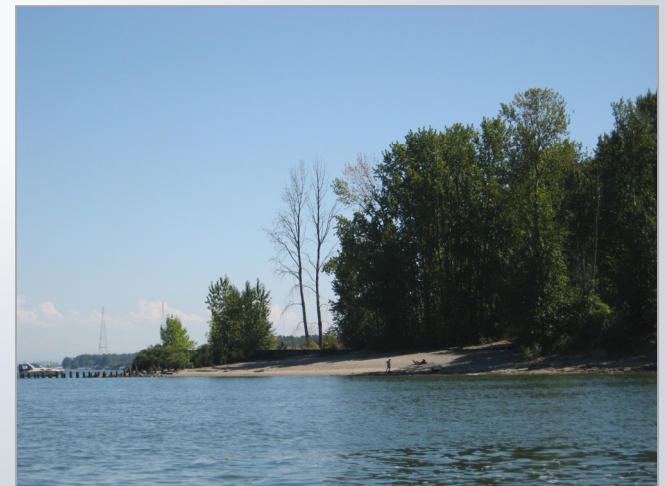
View of Kelley Point Park