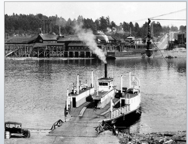
Sellwood Ferry, 1925