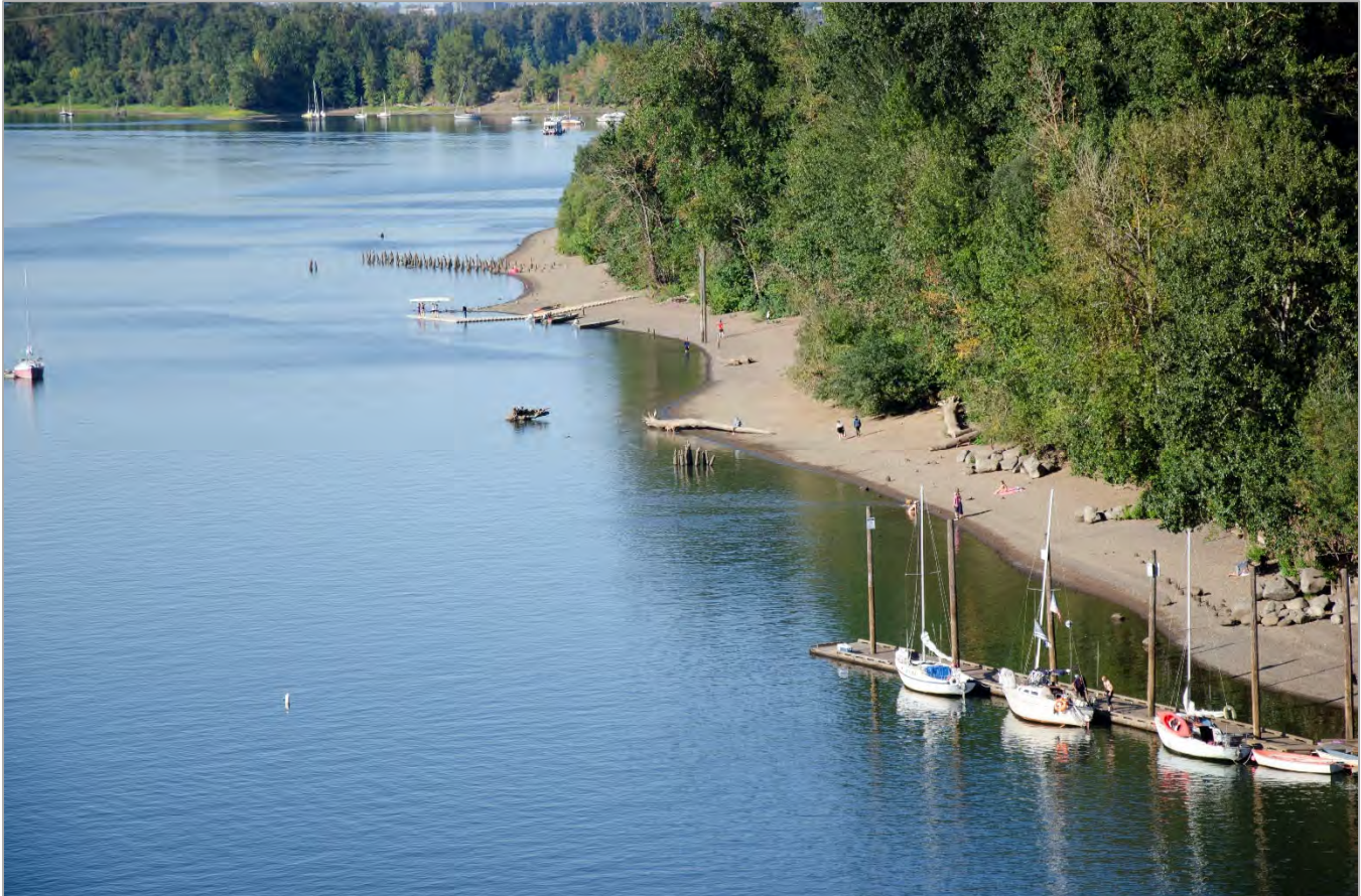
Looking north from Sellwood Riverfront Park