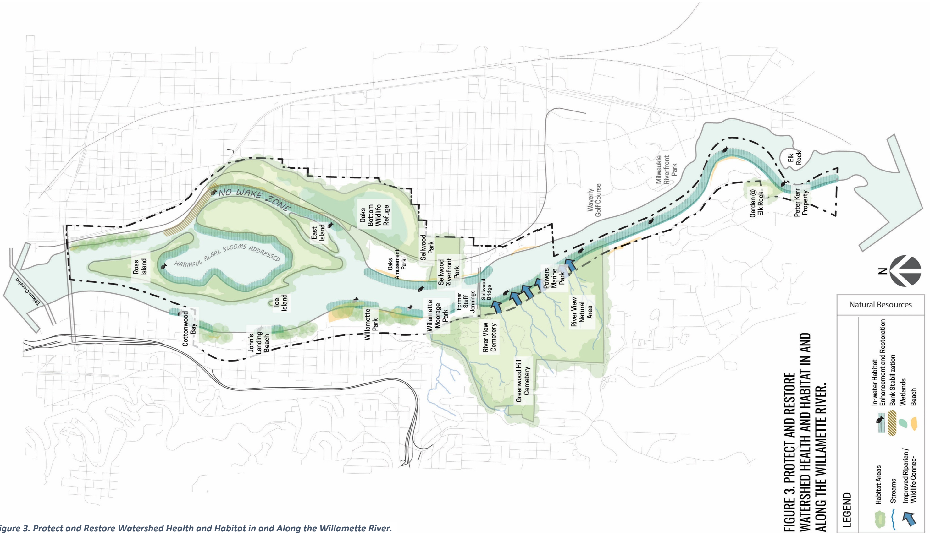
FIGURE 3. PROTECT AND RESTORE WATERSHED HEALTH AND HABITAT IN AND ALONG THE WILLAMETTE RIVER.