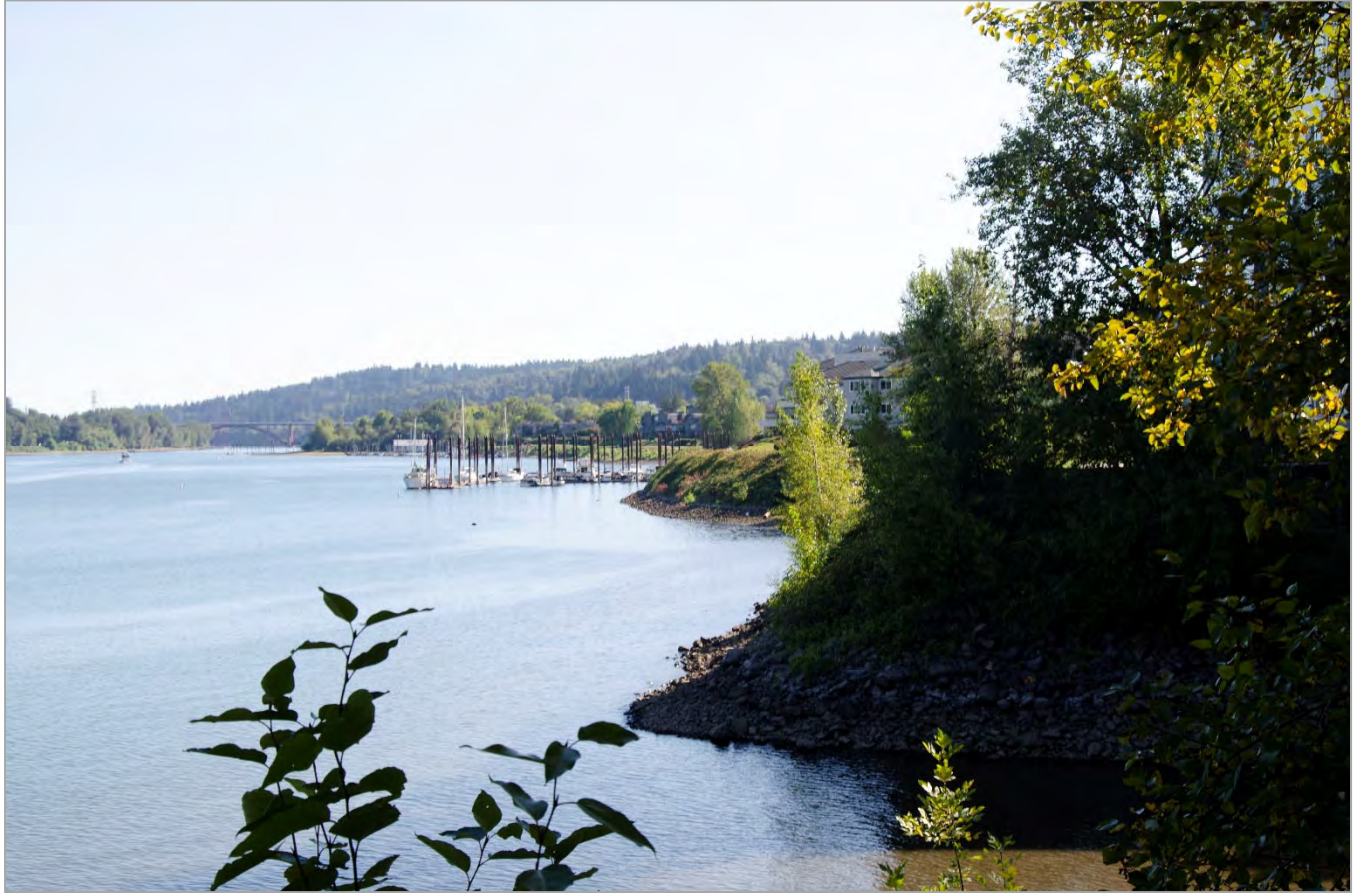
Looking south to the Sellwood Bridge from the Greenway Trail