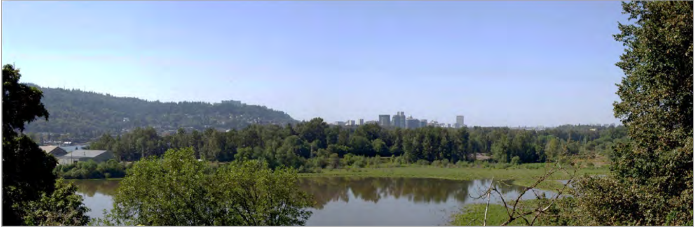
View of Oaks Bottom Wildlife Refuge with the Central City skyline in the background