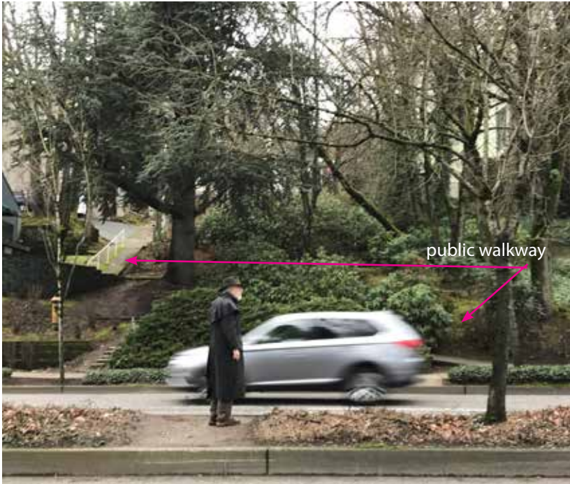
At Macadam, looking east to the sidewalk which turns and goes steeply up to Corbett/Richardson

On the other side of Macadam, looking east to the river is an inviting, wide trail to the greenway & Heron Pointe Wetlands