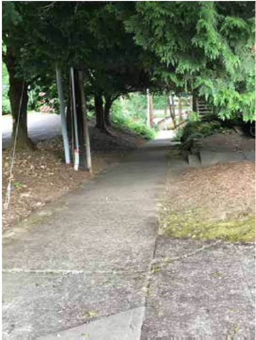
looking west, sidewalk from Corbett & Richardson that goes down to Macadam

The pedestrian connection from Corbett & Richardson, down to Macadam and the greenway at Heron Pointe Wetlands. A crosswalk at Macadam would be a safety improvement.