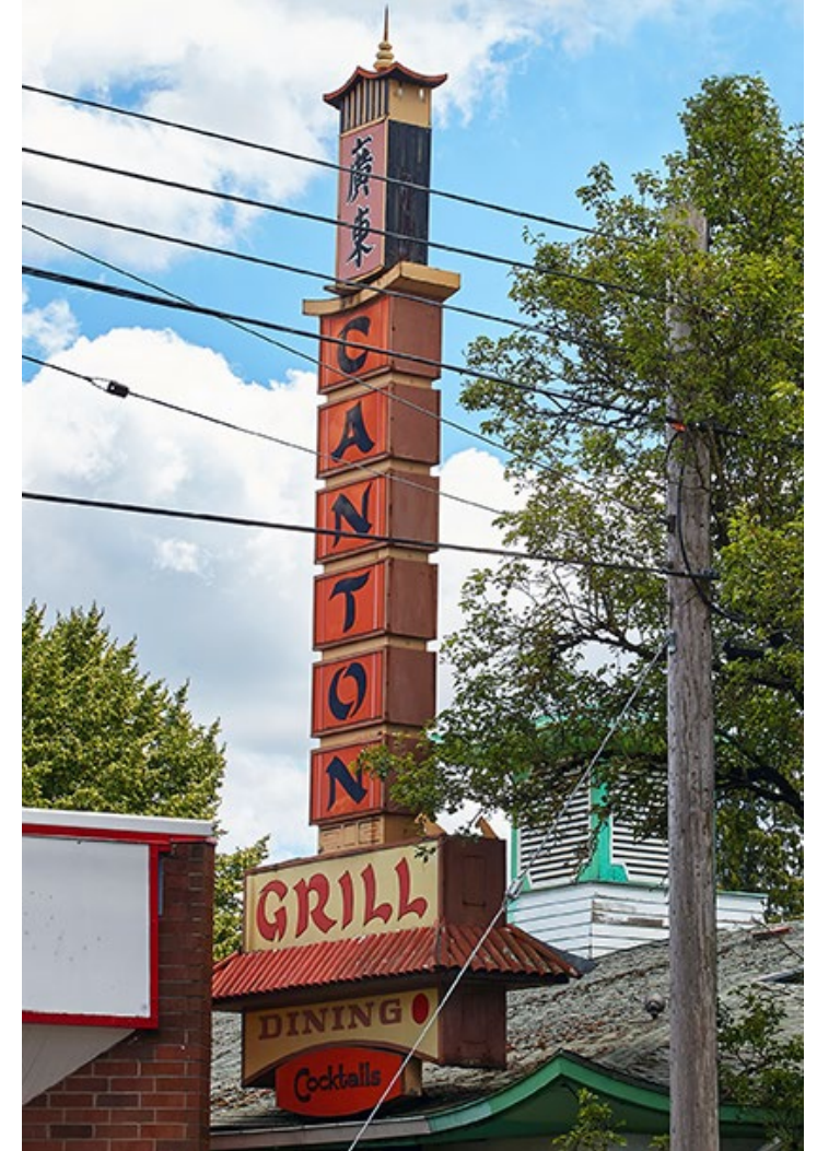
A resource that has neither been designated or evaluated for eligibility

2.b. Revise the criteria and procedures for locally designating, amending, and removing landmark and district status.