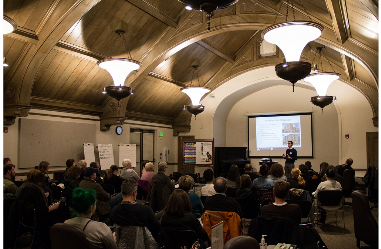
2018 HRCP Concept Development Workshop