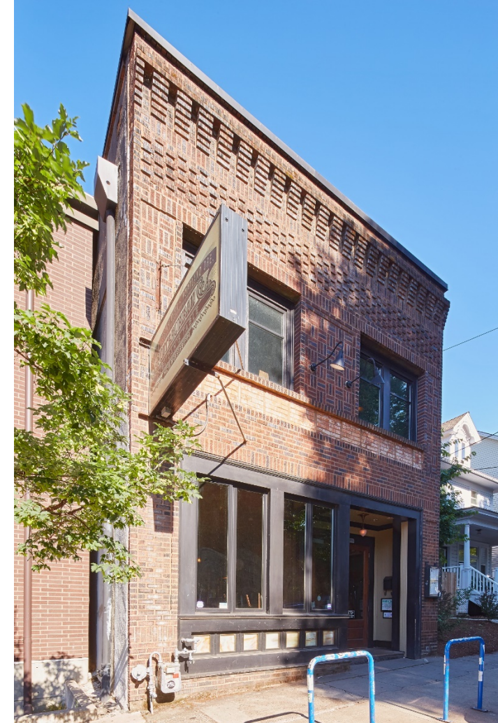
Mississippi Conservation District