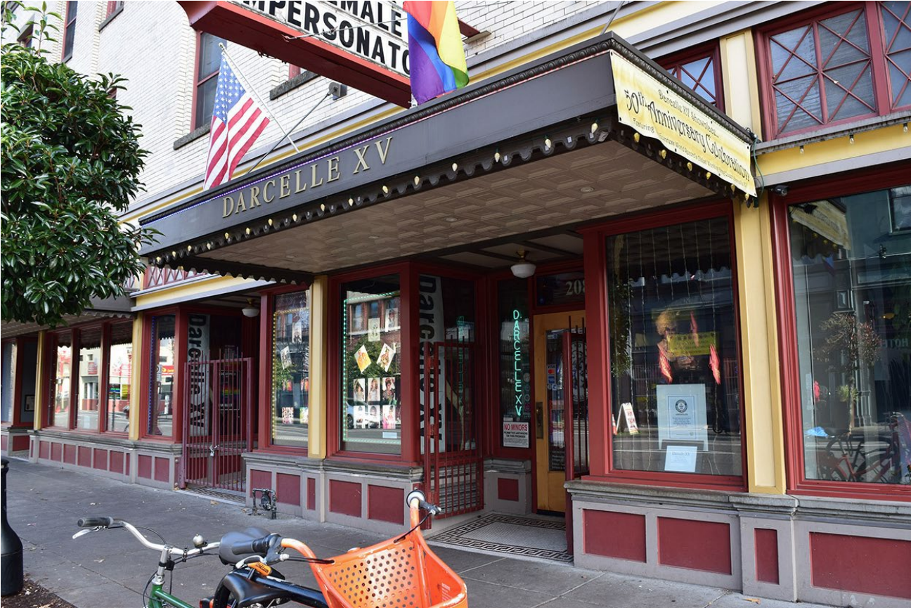
Darcelle XV Club (2020)