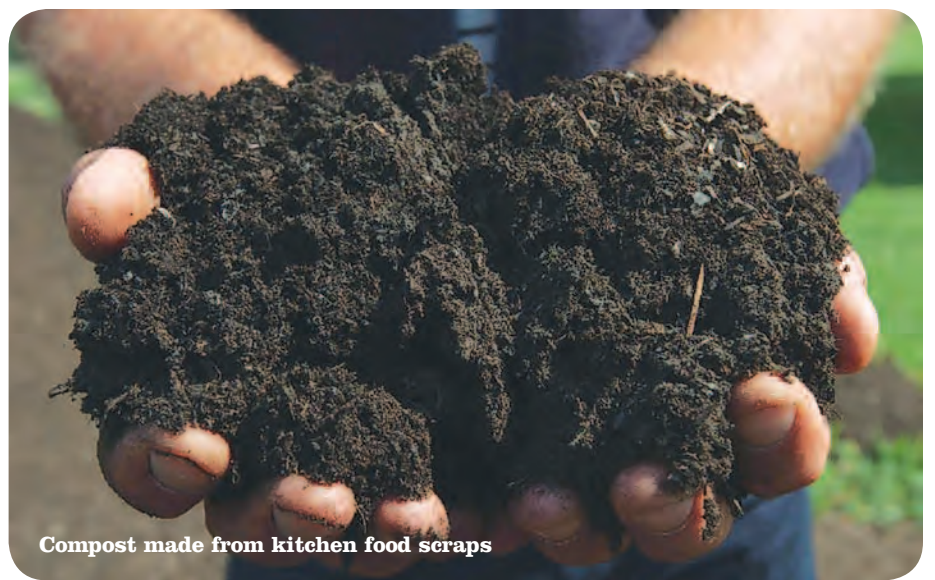
Compost made from kitchen food scraps