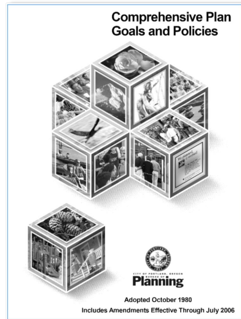
The 1980 Comprehensive Plan

The first step of Periodic Review is assessing the adequacy of the existing plan and background data to determine if conditions have changed enough to require the development of a new Comprehensive Plan or updates to portions of the Comprehensive Plan. The 2008 assessment showed that a significant update to the City’s Comprehensive Plan, including new background information, was needed. This direction ultimately resulted in the development of new Comprehensive Plan Goals and Policies and a substantial update to the Comprehensive Plan Map.