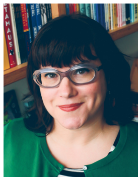
Chloe Eudaly Chloe Eudaly, PBOT Commissioner