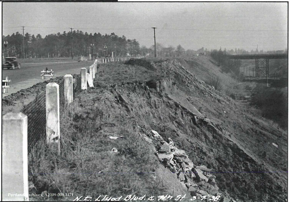
Sullivan's Gulch at NE Lloyd Blvd. and 7th St, 1938