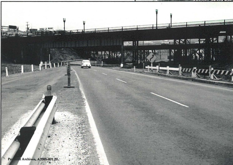
The Banfield Freeway at Grand Ave. looking West, 1959