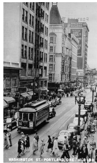
Washington Street, ca.1930s