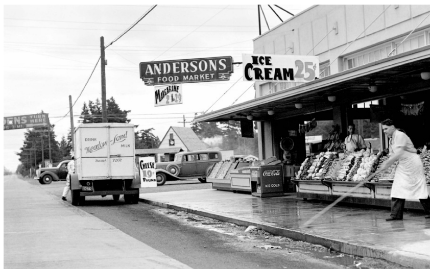
SE 82 nd and Powel, 1937

Available: http://www.portlandonline.com/bps/index.cfm?c=39764&